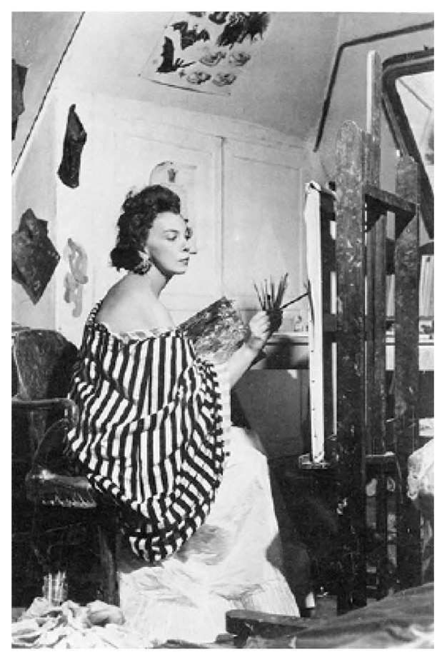
94 Léonor Fini in her studio in 1949