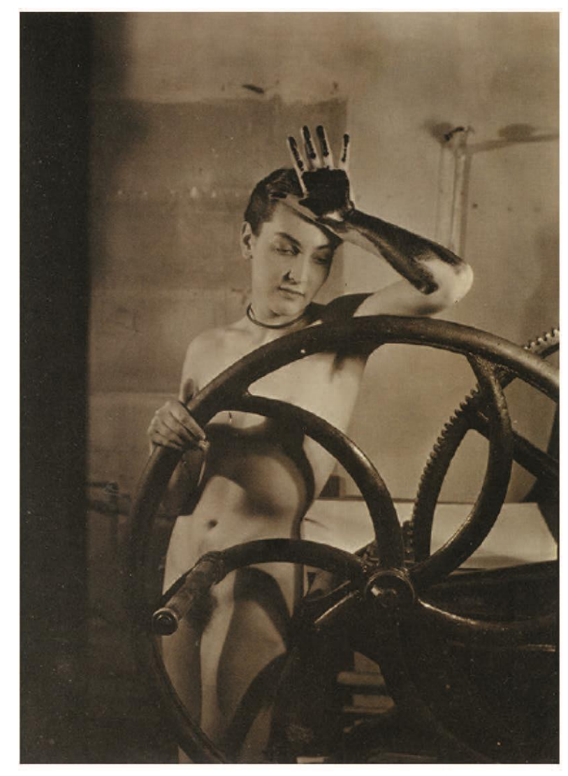
36 Brotíque Víolée—Méret Oppenheim photographed by Man Ray in 1933

58 WOMEN ARTISTS & THE SURREALIST MOVEMENT 1. SEARCH FOR A MUSE 59