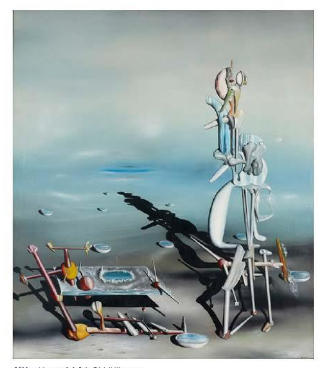
86 Yves Tanguy, Indefinite Divisibility, 1942