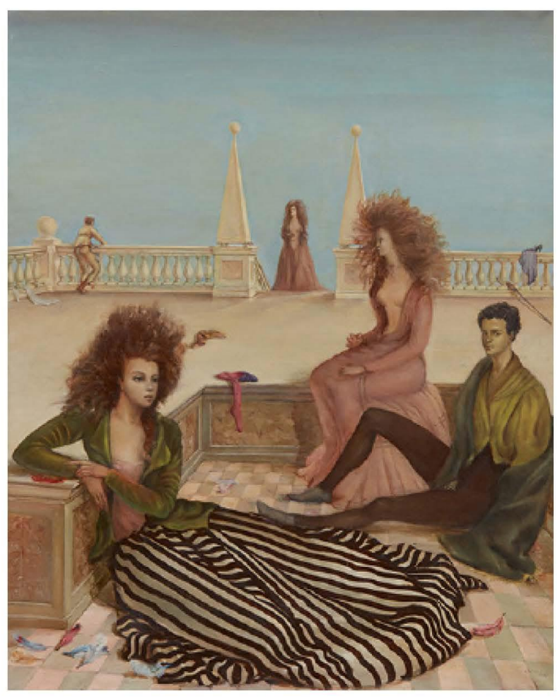
96 Léonor Fini, Composition with Figures on a Terrace, 1939