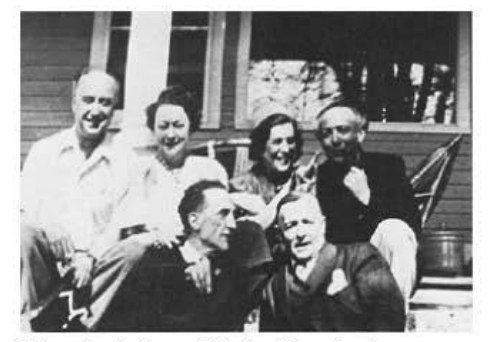
84 Surrealists ther Tanguy at Woodbury, Connecticut, in 1947

Sage and Tanguy settled in rural Woodbury, Connecticut, in 1940 and set up separate studiosin a harm on their property. In 1954 they agreed to a joint exhibition of their worl cat the Wadsworth Atheneum in Hartford, but Sage worried about having her paintings compared with Tanguy 's. In fact, both critics and the pu bic could immediately see not only the few similarities but also themany differences in their worls.