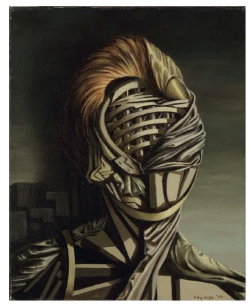
V Kay Sage, Small Portrait, 1950