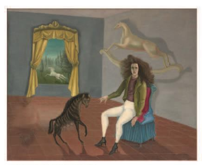
68 Leonora Carrington, Self-Pottmit, c. 1938

which occur in Carrington's later work, because it is faster than the wind and can fly through the air. The horse-headed sticks or "hobbyhorses" ridden by contemporary Morris dancers are a relic of Celtichorse worship, the cockhorse ridden to Banbury Cross to see the goddess make her ritual ride as Lady Godiva. Similar horse-headed sticks appear in the rituals of central Asian shamans, for the horse enables the shaman to fly through the air and reach the heavens. The Celtic Queen of Horses, the goddess who appears in the Welsh Saga of Rhiannon riding a pale white horse, is the goddess of the other world, and her horse travels through the space of hight as an image of death and rebirth.