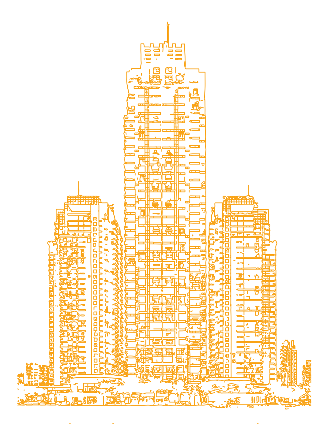
"Coming together is a beginning. Keeping together is progress. Working together is success."