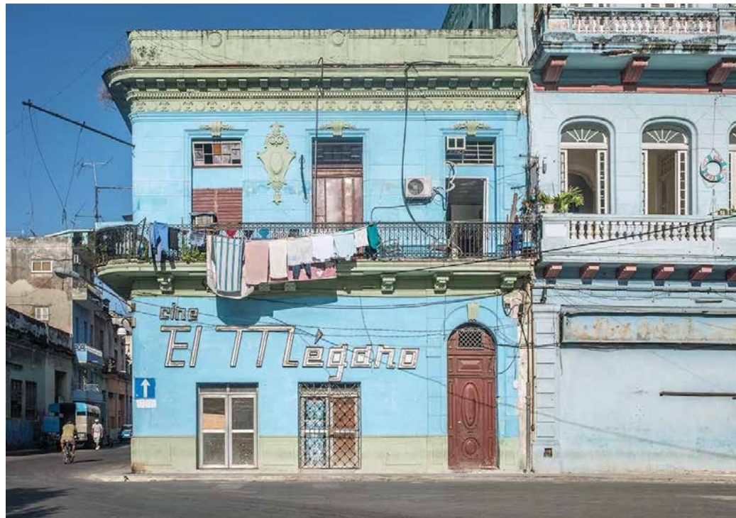
CINE EL MÉGANO LA HABANA VIEJA, HAVANA, CUBA