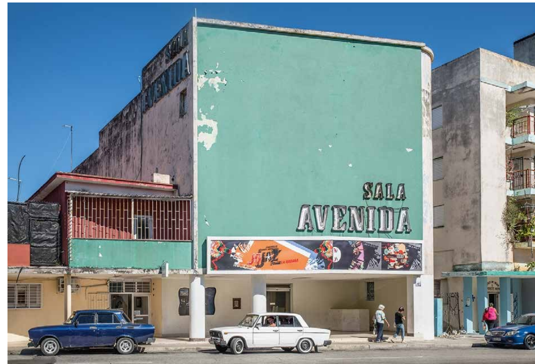
SALA AVENIDA PLAYA, HAVANA, CUBA