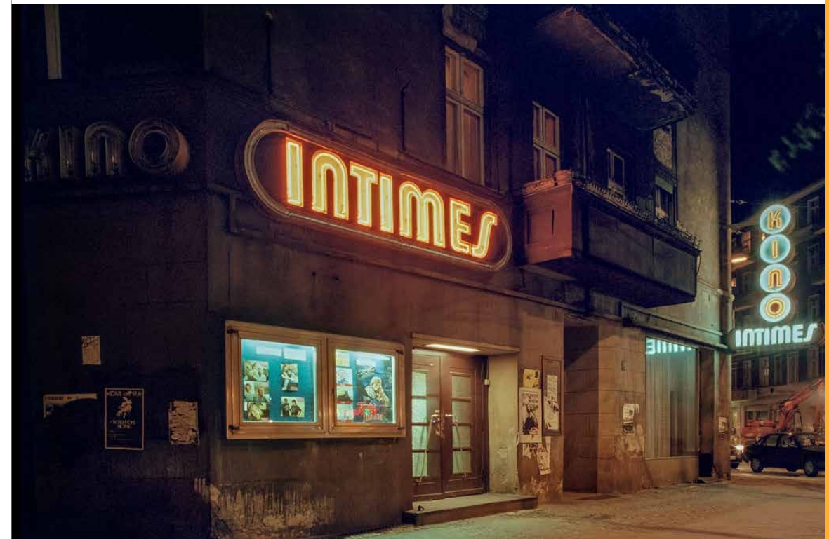
INTIMES KINO BOXHAGENER STRASSE, EAST BERLIN