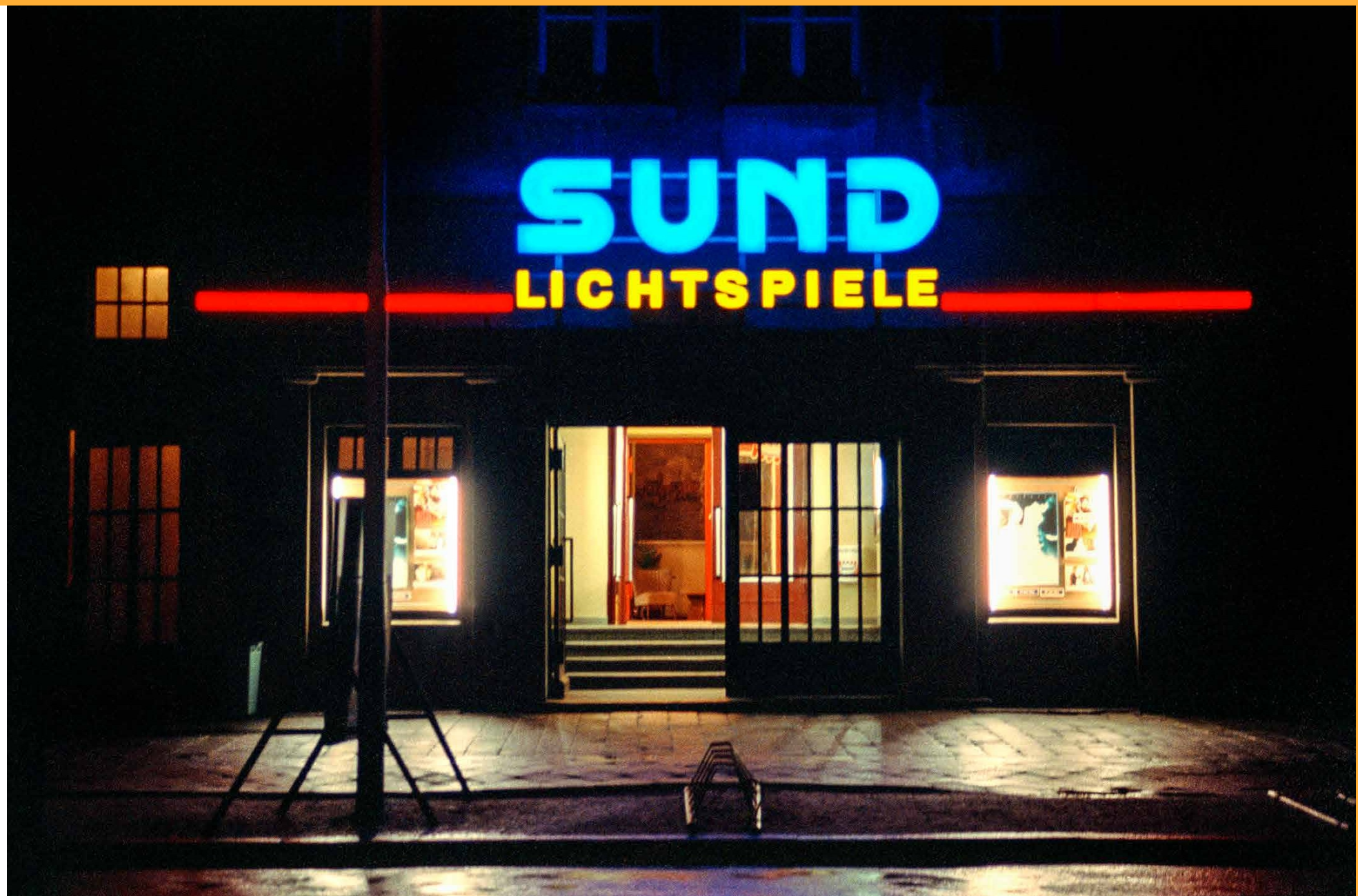
SUND LICHTSPIELE STRALSUND