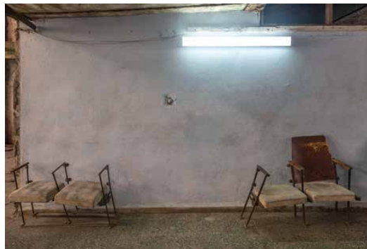
CINE VERDUN LA HABANA VIEJA, HAVANA, CUBA