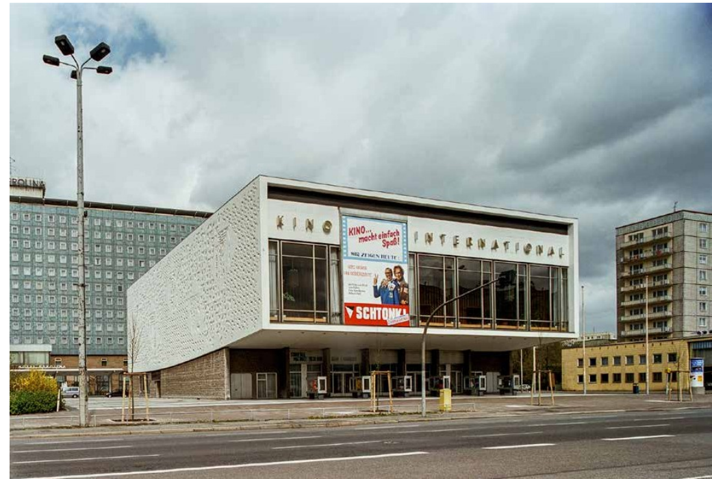
KINO INTERNATIONAL KARL-MARX-ALLEE, EAST BERLIN