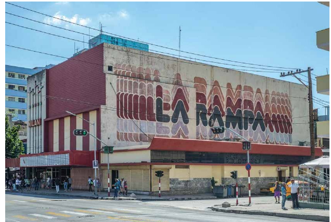
CINE MILAN / LA RAMPA VEDADO, HAVANA, CUBA