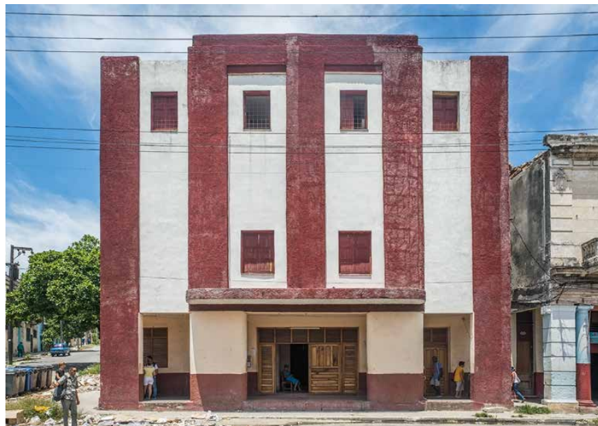
GRAN CINE CERRO CERRO, HAVANA, CUBA