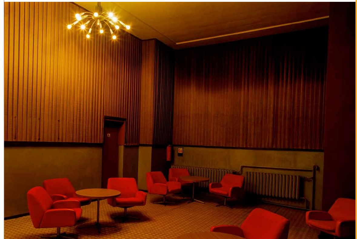
ALHAMBRA ERFURT, THURINGIA