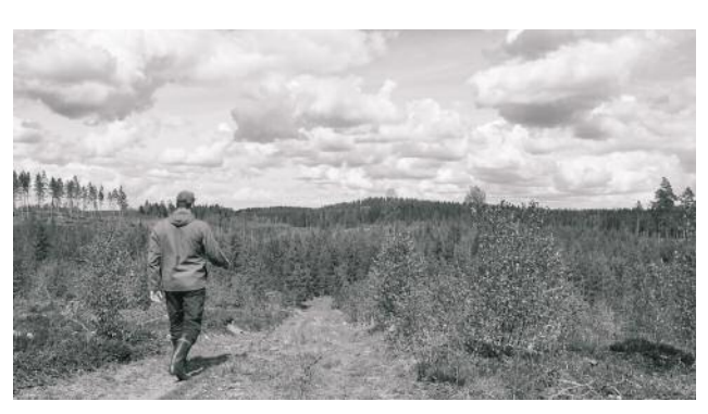
12 Making of Colliding Generations, 2017