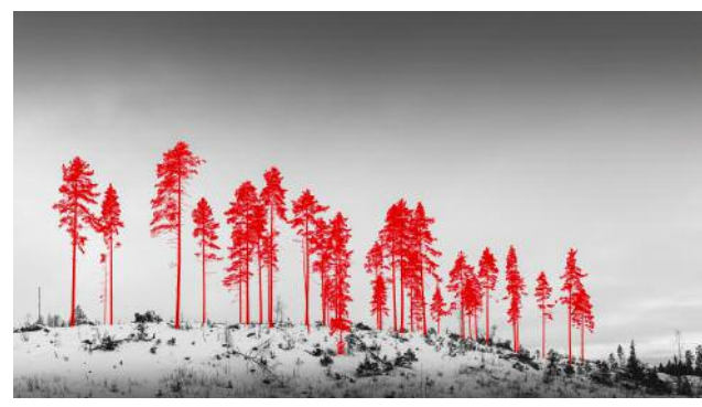
08 Next Possible Victims , 2018 © Jaakko Kahilaniemi