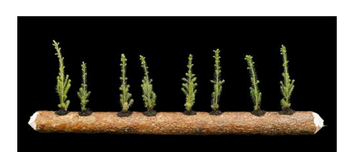
03 Colliding Generations , 2017 © Jaakko Kahilaniemi