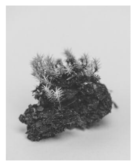
01 54 Grams of Soil from 54 Different Solutions, 2017 © Jaakko Kahilaniemi