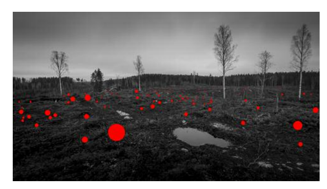
02 100 Mistakes Made by Previous Generations, 2017