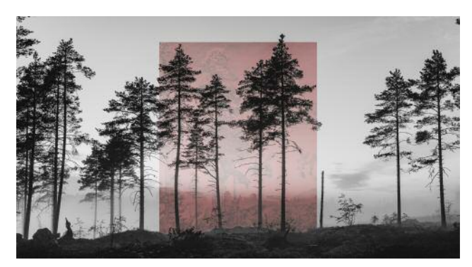
11 Patriotism and Romanticism Studies (Gallen Kallela 1896), 2017