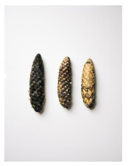
10 Picked Fragments , 2016 © Jaakko Kahilaniemi