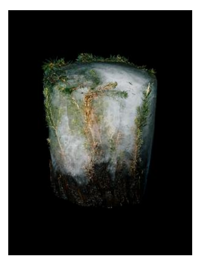
09 Preserving Nature , 2018 © Jaakko Kahilaniemi