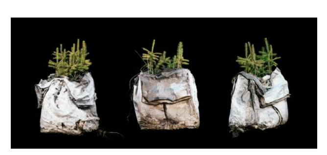
07 Package of Power , 2020