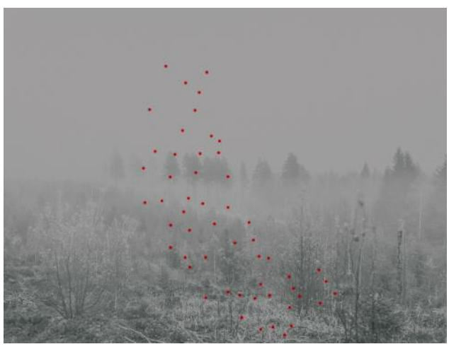
04 54 Different Solutions , 2017