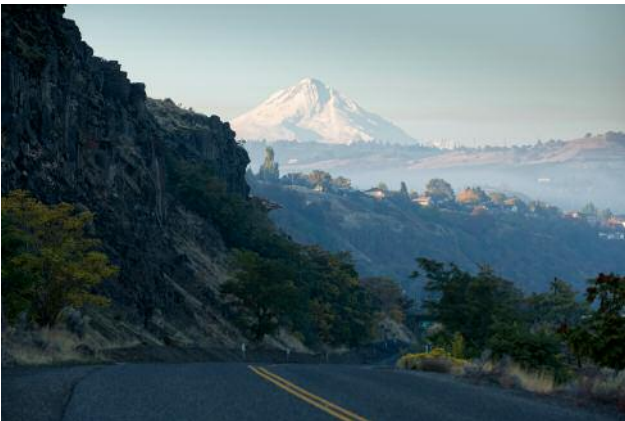
05_The Dalles, Oregon