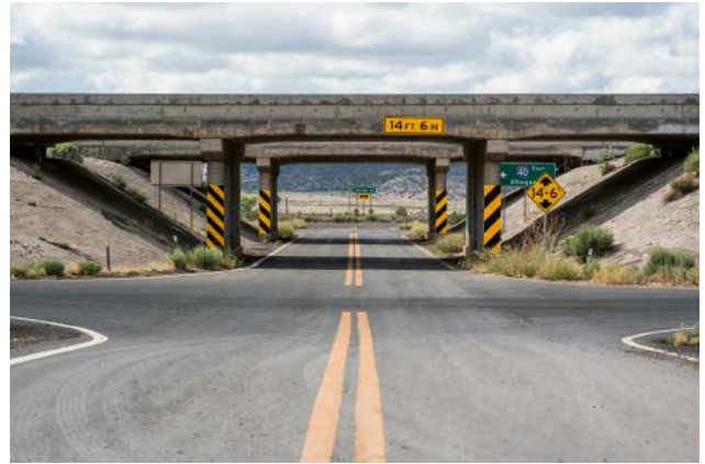
08_Houck, Arizona