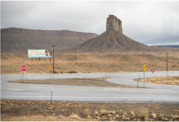
01_Towaoc, Colorado