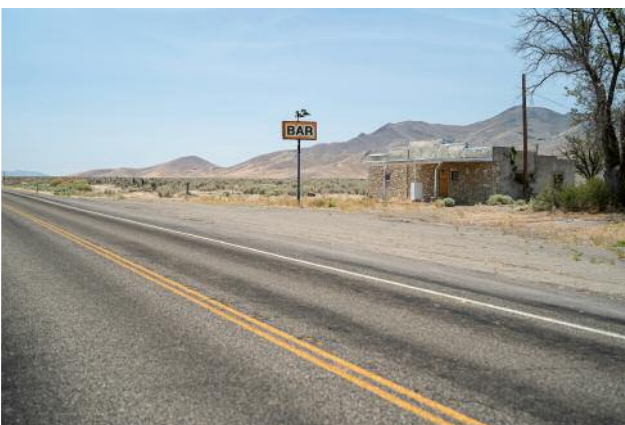
11_Rebel Creek, Nevada