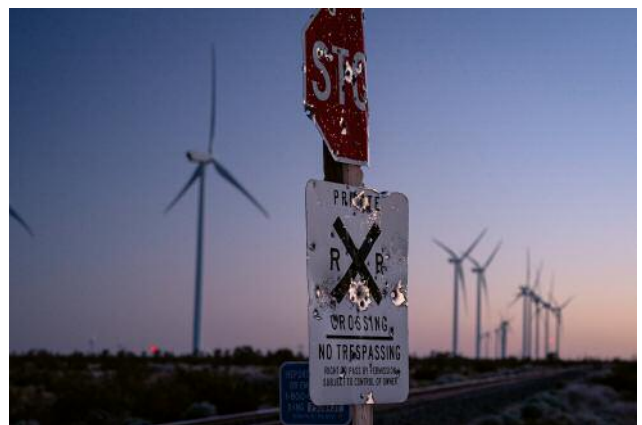
12_Mojave, California