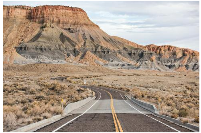
02_Emery, Utah