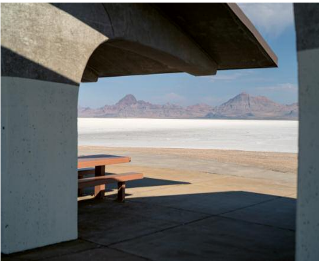
09_Bonneville, Utah