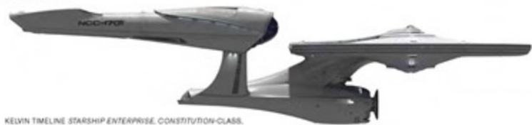
KELVIN TIMELINE STARSHIP ENTERPRISE, CONSTITUTION-CLASS, OVERALL LENGTH 325 METERS