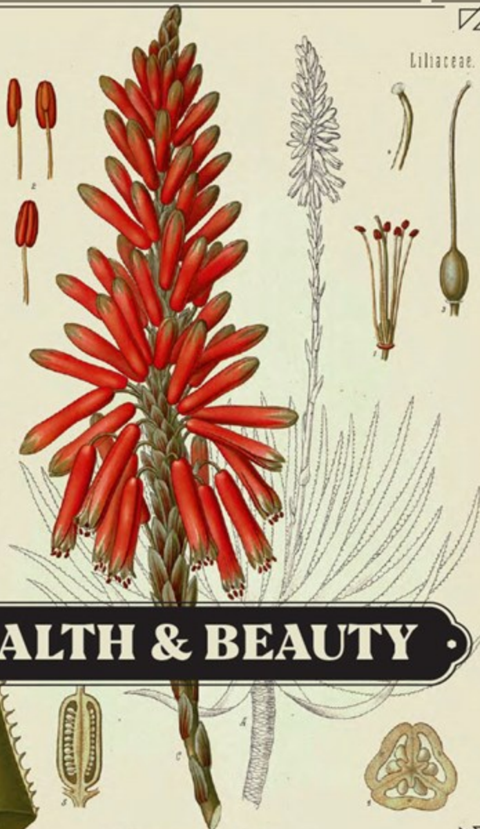
Aloe socotrina Lam.