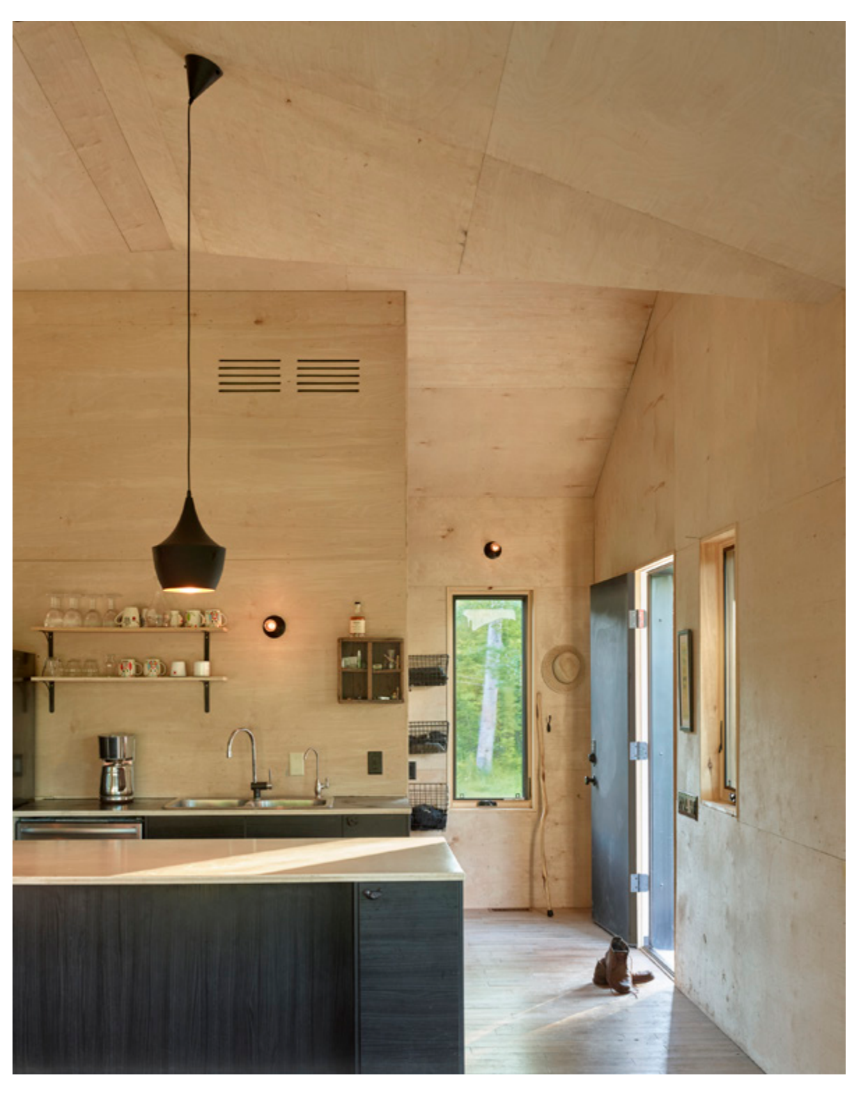
Enough photos to make this two spreads if needed. 171