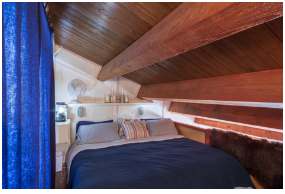
We've featured on the site and I've always liked this one. The owner seems nice, and had the cabin professionally phtographed for the book! 57

The Cabin is fully off the grid with a Solar power, Composting toilet , instant hot water heat , hot showers , Full king size bed in the loft with additional sleeping in the Cabin for 6 people in all. Glam Camping at its finest. If Armageddon comes that were we will head.