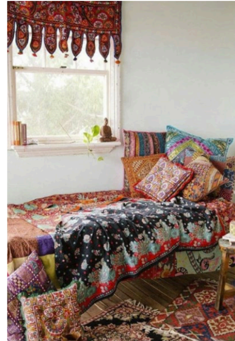
▲ Mix textiles sourced from far flung places with heirloom pieces and carefully chosen high-street finds.

The essence of Bohemian design is non-conformism and individualism. A lace tablecloth found in a thrift store can be hung up as a curtain. A sari from India can serve as a tablecloth or get made into cushions; rugs can be hung on the wall and blankets can double up as curtains. There is no place for matching bedding and curtains and it is best to seek out artisan makers or search for vintage items that you can repurpose yourself. That said, some high street stores do sell a good selection of interesting textiles which, when mixed with a few carefully chosen individual pieces, will work just fine.