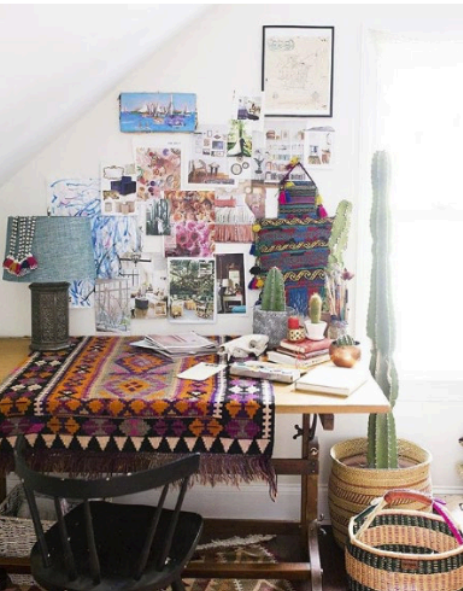
▲ Heaping texture, pattern, and color is a hallmark of boho styling.

It is impossible to talk about Bohemian design without mentioning the abundance of textiles that feature in it. Think multi-tonal ikat, tie dye, lace, crochet, brocades, the possibilities are endless when it comes to layering fabrics. There is no one-size-fits-all solution. Walking into a Bohemian home is a visual and tactile feast where no color or texture is off-limit.