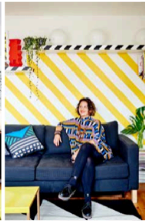
Stripes are magical – just ask any beach umbrella in the south of France.