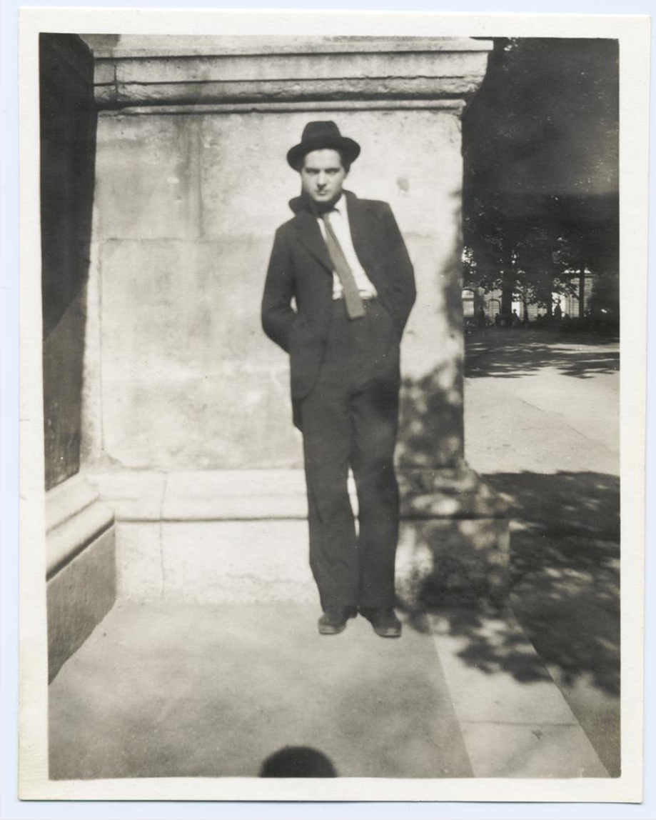
© The Estate of Francis Bacon