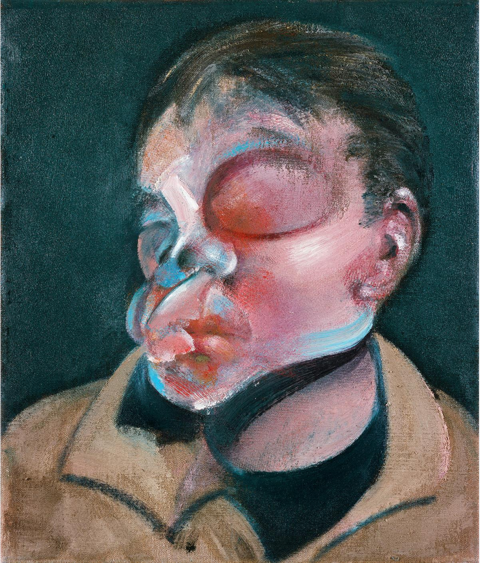
© The Estate of Francis Bacon