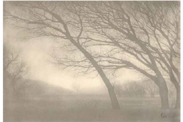
19 | VALLEY OF THE LONG WIND, 1913