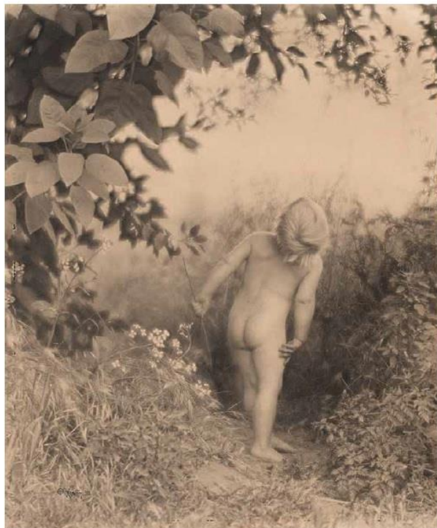
21 | I DO BELIEVE IN FAIRIES, 1913