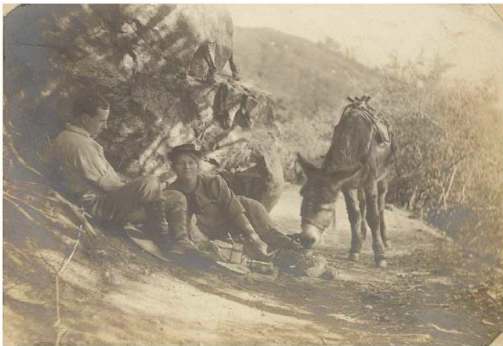
9 | HONEYMOON TRIP, 1909