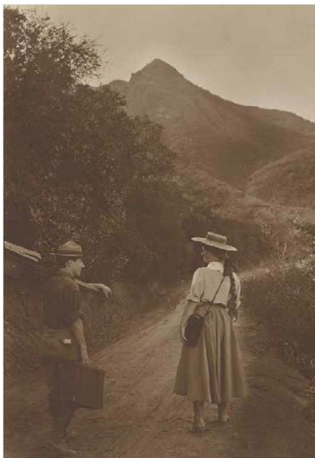
16 | IN VACATION TIME, ABOUT 1909