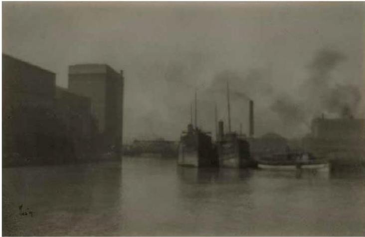
18 | CHICAGO RIVER HARBOR, ABOUT 1908