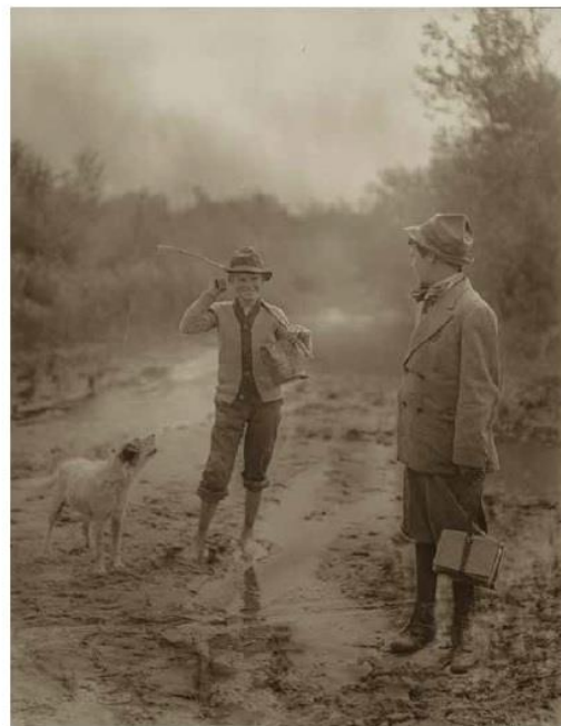
17 | LET'S PLAY HOOKEY, 1911