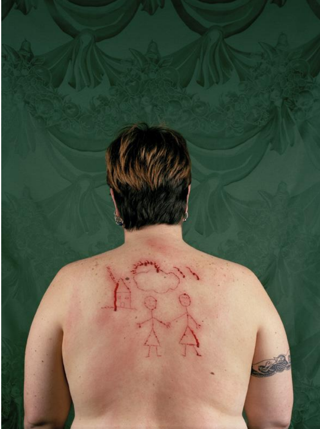
Catherine Opie, Self-Portrait/Cutting, 1993.