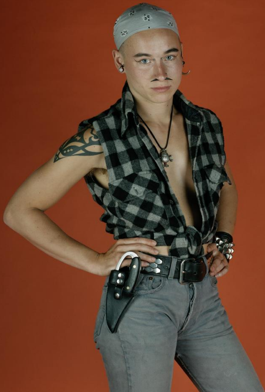
Catherine Opie, Idexa, 1993.