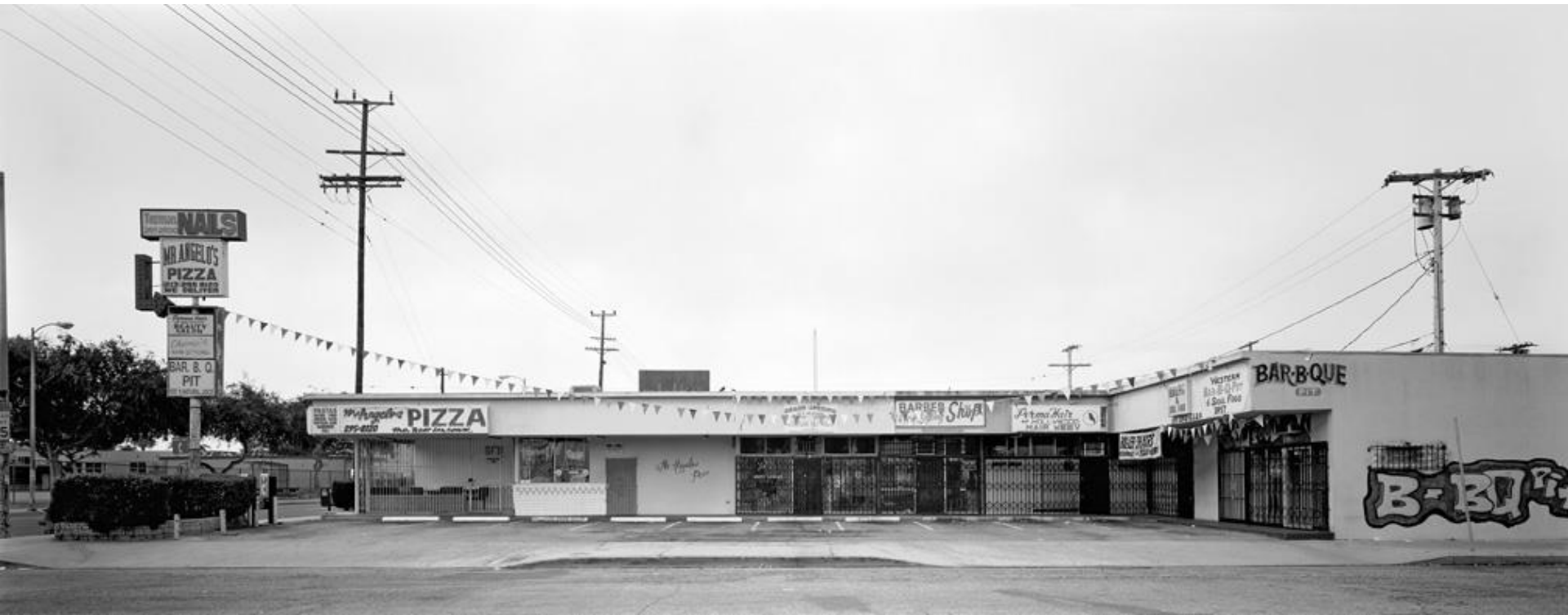
Catherine Opie, Untitled #3 ( Mini-malls), 1997.