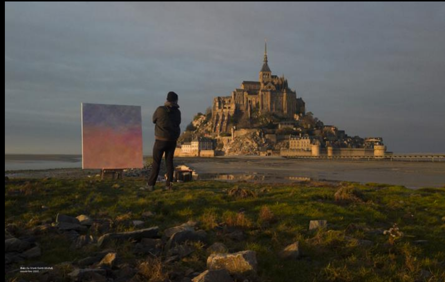
« Mont-Saint-Michel » septembre 2013