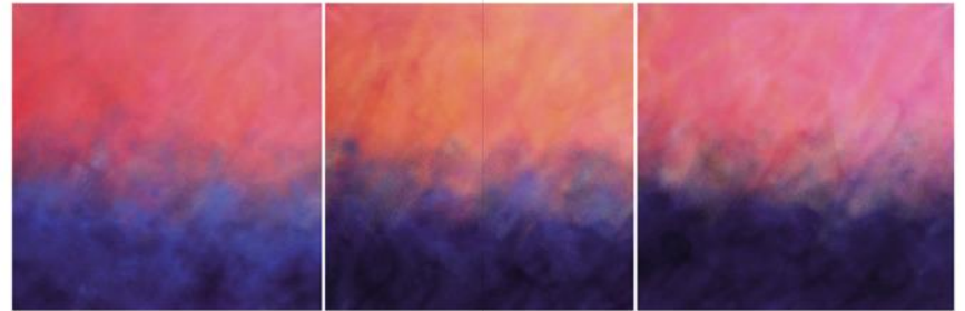
« L'ÉPIQUE, LES FIC, LES FIM, TROPICAN 2017 » du 10/11/2017 au 10/12/2017