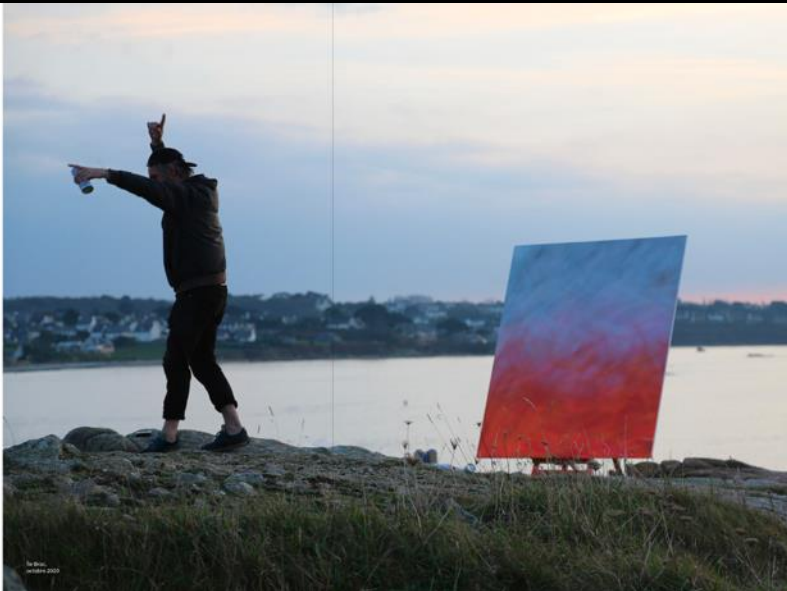
« Le Bateau » septembre 2013