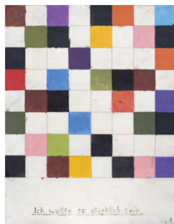
Drawings from the series "St. Paul" of Martin Assig: #43, #99, #128, #183, #850, #411, #250

308 Pages, 236 color plates 24 x 29 cm, hardcover ISBN 978-3-8296-0969-2 [ENGLISH | GERMAN] € 58.-, CHF 66.70 Available