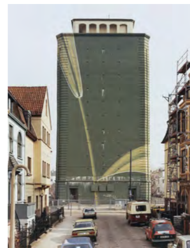
Boris Becker: Bremen, Hardenbergstraße, 1987, from the High-rise Bunkers series