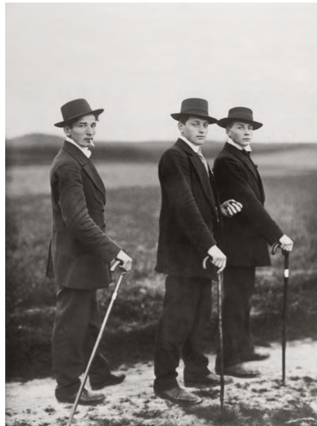
August Sander: Young Farmers, 1914

Photographic concepts and sequences. Catalog of the Photographic Collection / SK Stiftung Kultur, Cologne