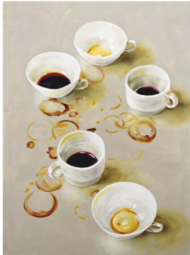
Cups, 2016. Oil on canvas, 190 x 40 cm

Vom Erscheinen und Verschwinden der Dinge - The Appearance and Disappearance of All Things