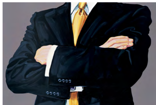
Hands, 2002. Oil on canvas, 160 x 240 cm