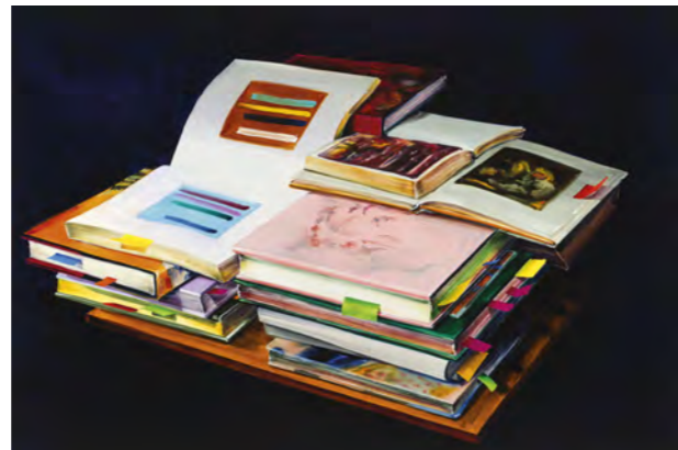
Stripes, 2019. Oil on canvas, 200 x 30 cm