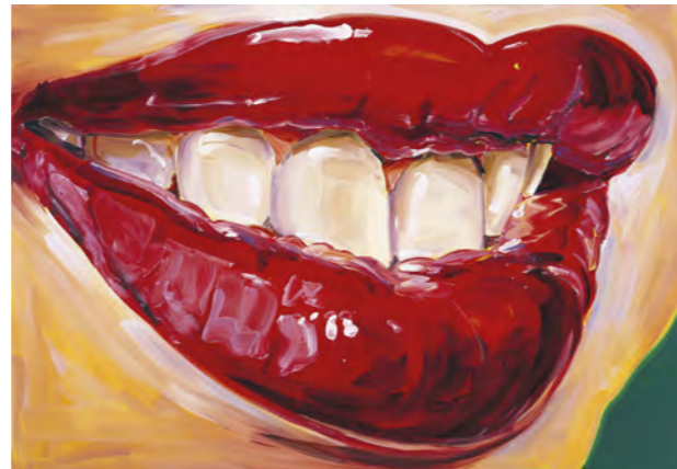
Lips, 2011. Oil on canvas, 190 x 275 cm