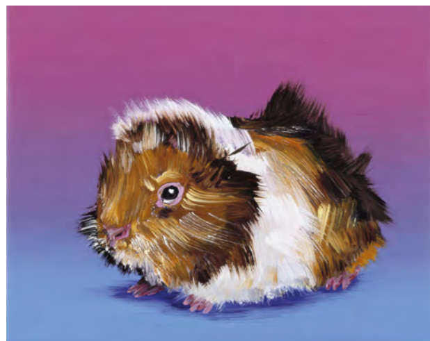
Guinea Pig, 2003. Oil on canvas, 40 x 50 cm