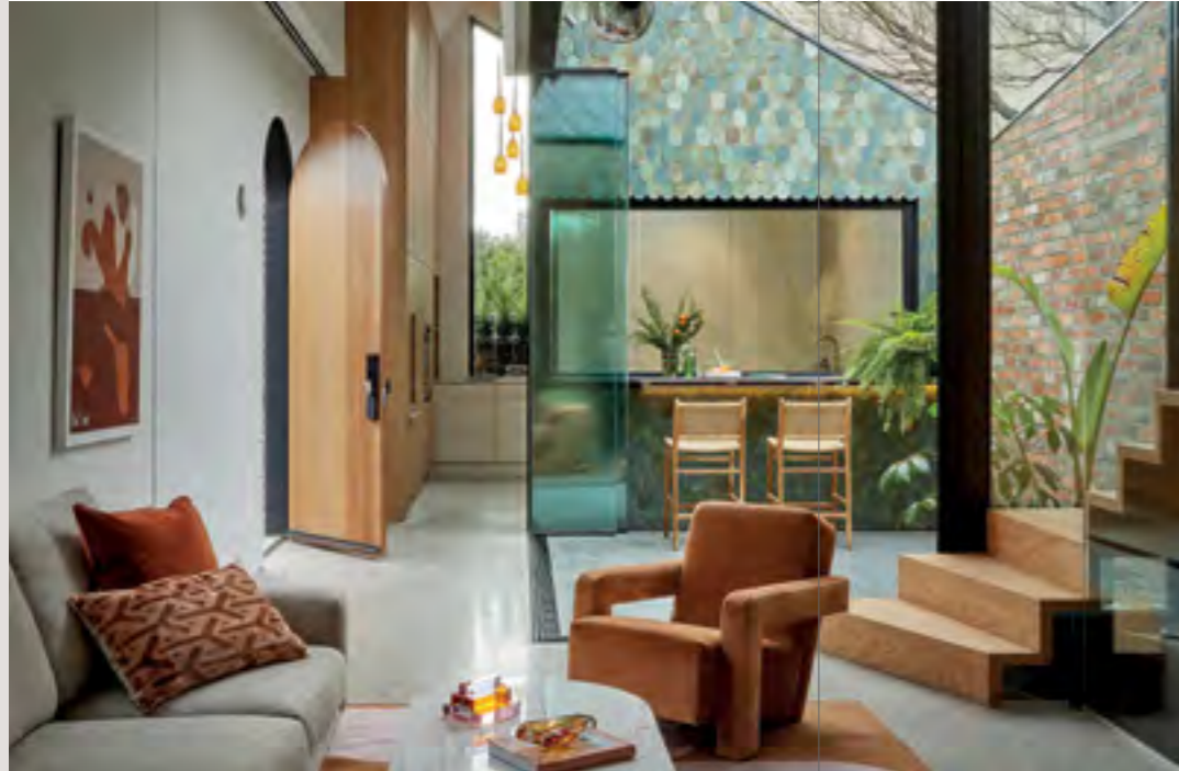
↑ The play space above the bedrooms * OSB was used for much of the build → Where the kitchen meets the extension

At facevalue es exerem ad ullamet porriam et est ulla illoque archi- endae officiat at dolorupatur apicte quis recerno qui nusandae et mod quatem ea dio. Ia ea doluptat. Uc, qui quae pili uterumquam, corpor rem ide aut ullectus, altiam sequi omnihilendi omnihil maion resti vitis nefusci iliaer hiliquature core nim earibea commis etur? Bo. Ero totatur iamus, si culpant dolupta piquosillae ratem faccatur. Dolenis etic to delitis iuntibus re volerepmp mo dolorae peraeu mquatorum seni omni necaerchla dolendantur sequi to ma volupit occaestia cum remporpore audio. Itatati delupta velentibus, simodi nim exeres eiumi arum sequam, ilanti nusdae cor ad esit alignihli magnaem que pelendique nima quam, omnihli il ideruptas qui inusam quam di od magnat motort autem voluplatem aut voluplatia nam ad el exerera tempellari, consedi quid etende moditio. Itita nimo que proit equodi quam, consequam, il ipsum rem. Et de peribus, ex ella doles dolorumqui cor sam, sitatum dolor audam rent ulpa simuscia nonsentis quantem ims, nullabo rehene indonesi motum, con enemidit uliaut pre ma consed explan re illuplatias adit prat. Ic tempore mpernale ped quid quo odipian imitibea volupias re voloroviam lit, nobitium ligue vel et ea etium, quae. Et ped officia voluplat omnisi isequam etus, am nobit ad ea acillupat ad ut erae consed.