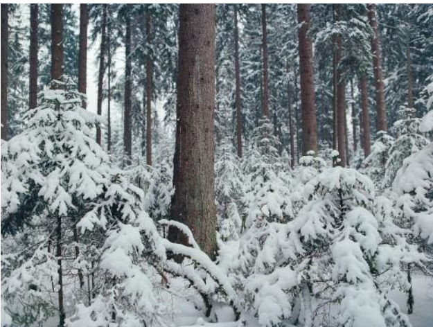
09_Winterheide, Lüneburger Heide, 2016