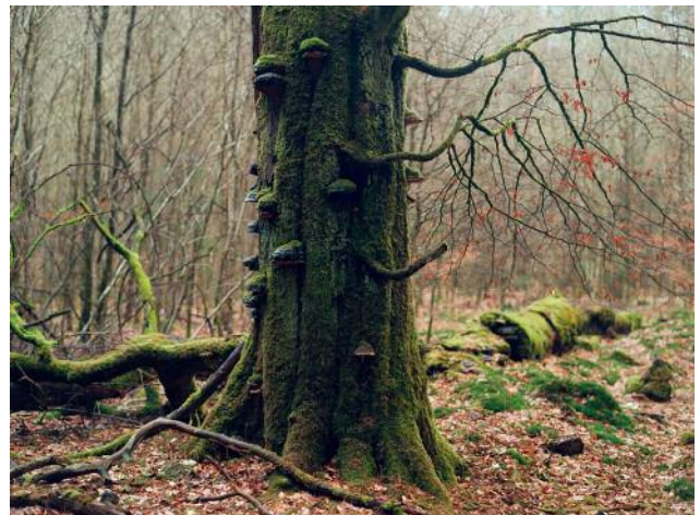
10_Friedrichsruh, Sachsenwald, 2016