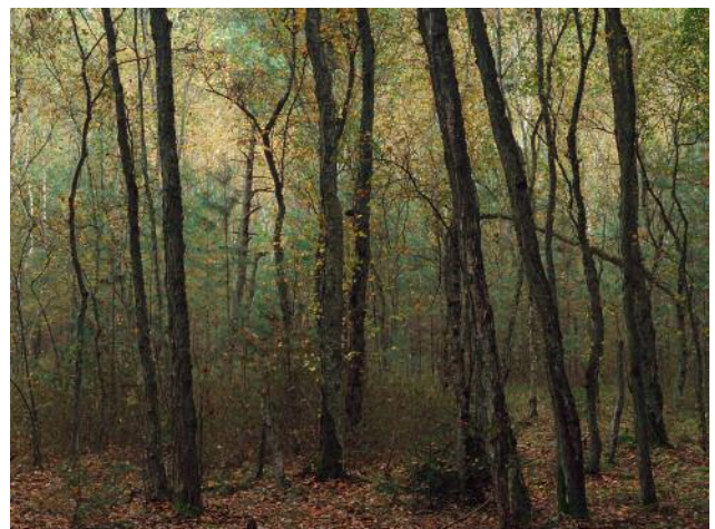
12_Fennweg Moor, Plagefenn, 2020