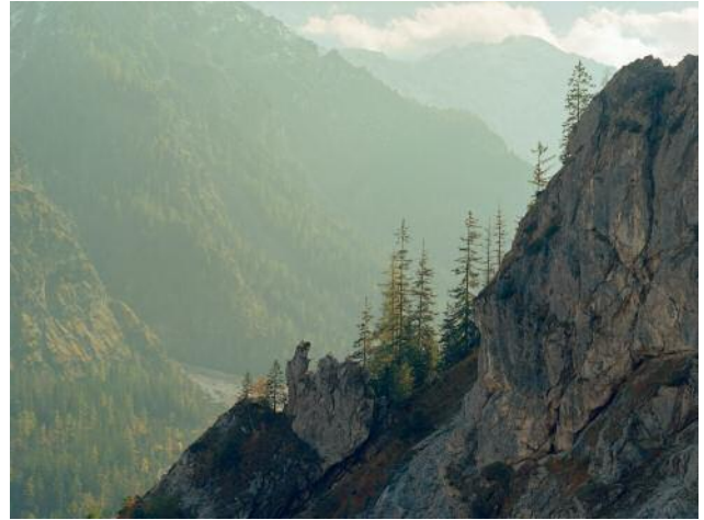
08_Wimbachtal, Berchtesgadener Land, 2016