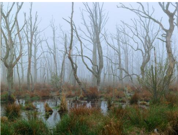
11_Osterwald, Vorpommersche Bodden, 2019