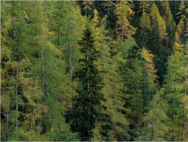
07_Blaue Schärtenwand, Berchtesgadener Land, 2016