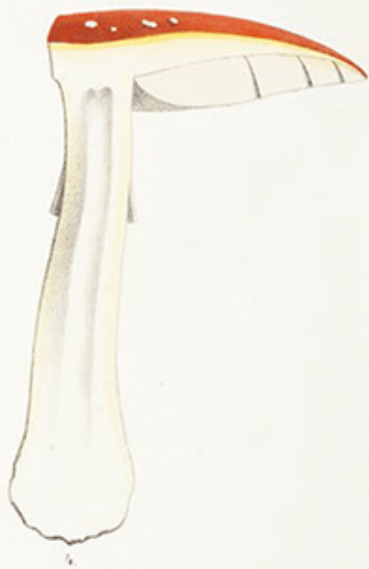
1.2. Agaricus caesareus Scop. 3.4. Agaricus muscarius Linn.