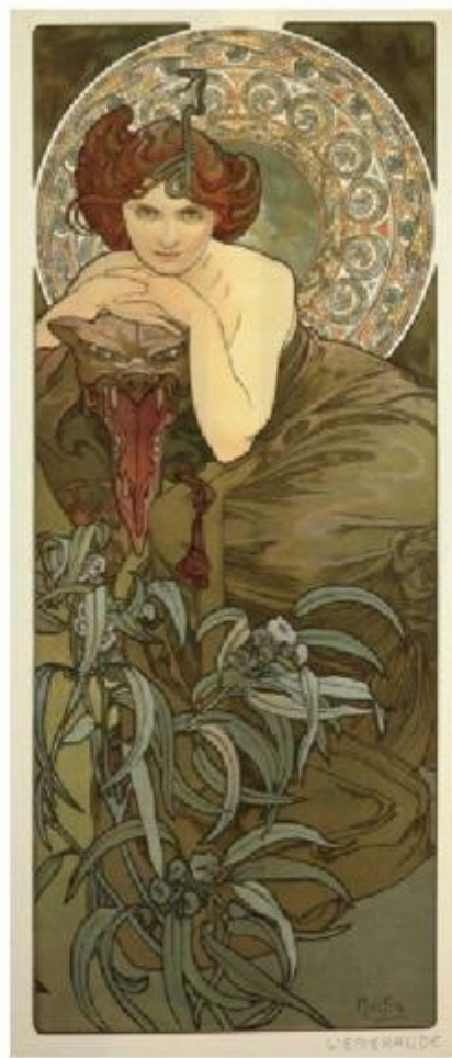
Le piano parisis: Topazo, Rubino, Ametista, Smeraldo, 1900 Serie di quattro pannelli decorativi Litografia a colori, 67,2 x 30 cm ciascuna