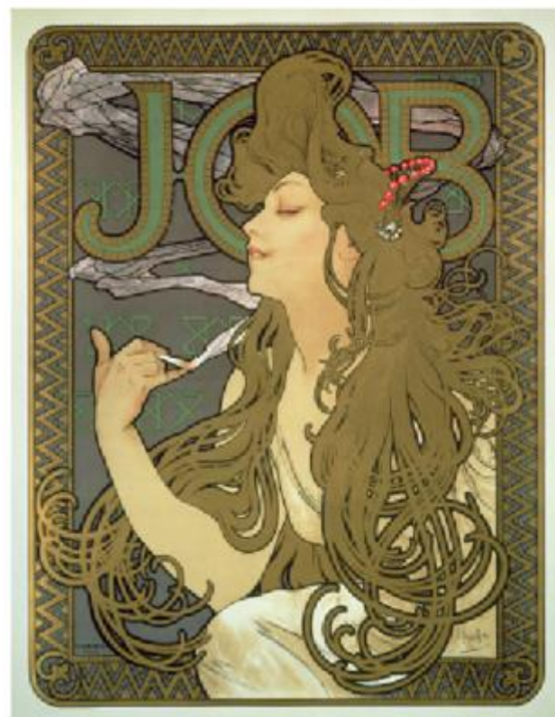
Imprimerie Cassan Fils, 1896 Litografia a colori, 174,7 x 69,4 cm Job, 1896 Litografia a colori, 66,7 x 40,4 cm