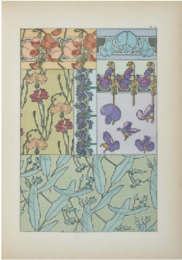
Documents décoratifs , tavola 41, 1902 Da Documents décoratifs , edito da Librairie Central des Beaux-Arts, Paris Litografia a colori, 46 x 33 cm