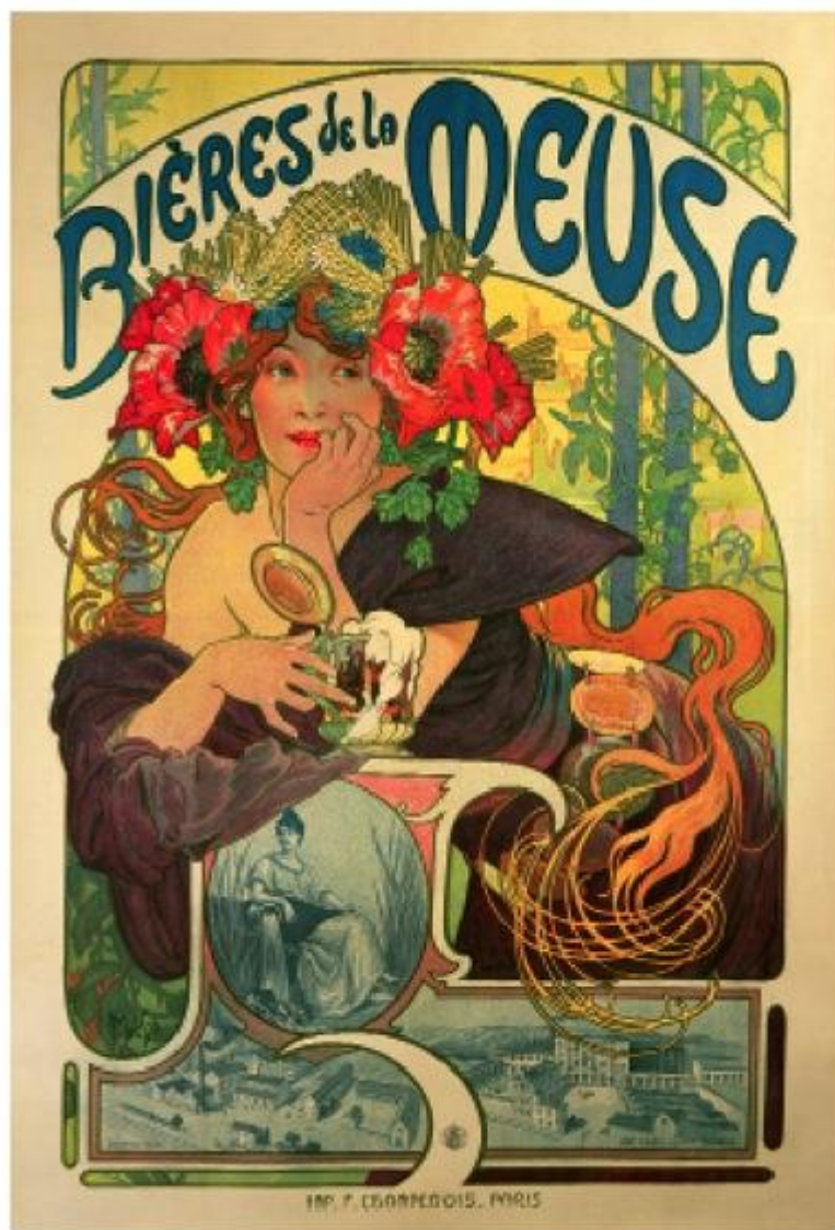
Bières de la Meuse, 1897 Litografia a colori, 154,5 x 104,5 cm