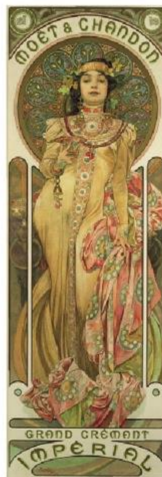
Moët & Chandon: Grand Crémant Impérial, 1899 Litografia a colori, 60 x 20 cm