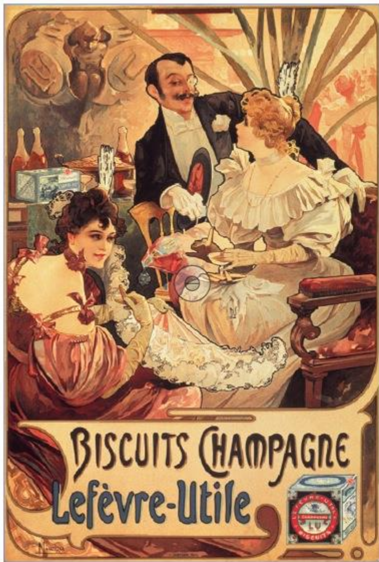
Biscuits Champagne Lefèvre-Utile, 1896 Litografia a colori, 52,1 x 35,2 cm Scatole per i biscotti Lefèvre-Utile: Gaufrettes Vanille, 1900 circa Scatole di latte rivestite con etichetta litografata, 19,3 x 19,3 x 17,5 cm