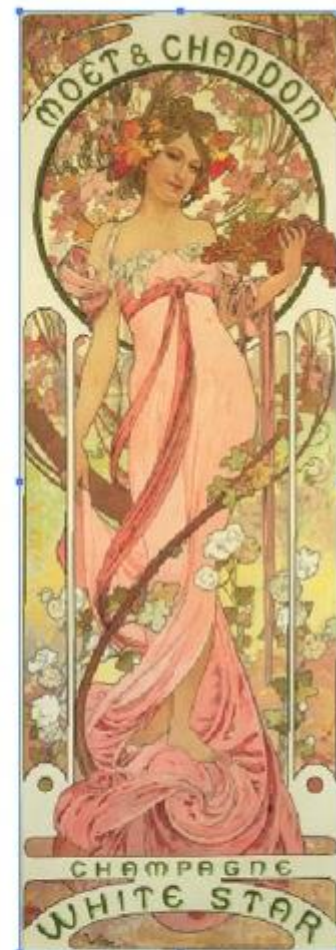
Moët & Chandon: Champagne White Star, 1899 Litografia a colori, 60 x 20 cm