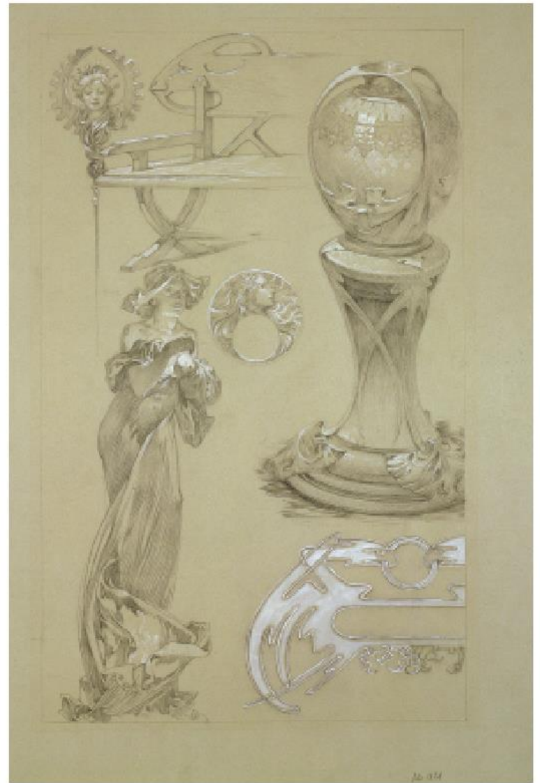
Documents décoratifs , disegno finale per tavole 67, 1901-1902 circa Matita e bianco su carta, 60 x 40 cm