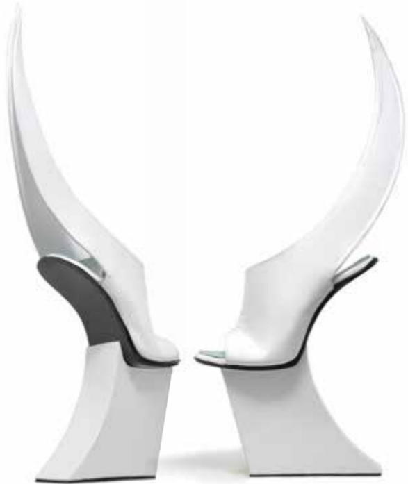
Oscillation 7 © Carolin Holzhuber