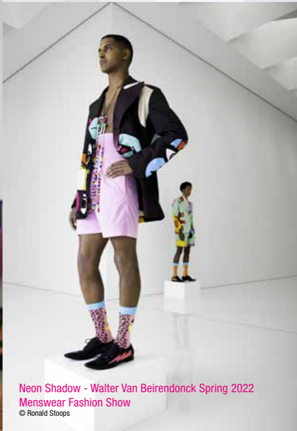
Neon Shadow - Walter Van Beirendonck Spring 2022 Menswear Fashion Show