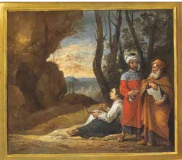
FIG 10 David Teniers II Archduke Leopold Wilhelm in His Gallery in Brussels. Detail of fig. 4 (Vienna): Giorgione's Three Philosophers