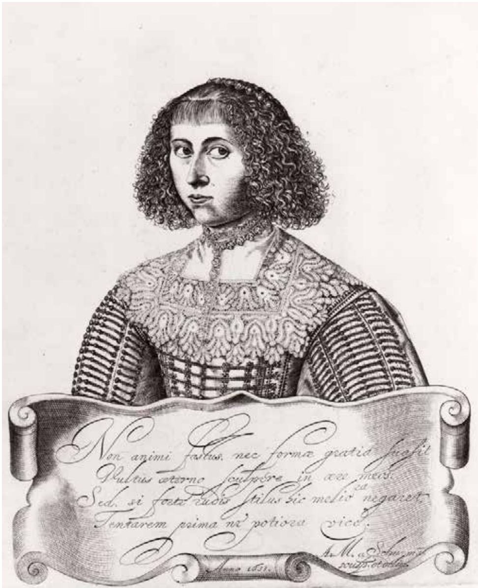
FIG 7 Anna Maria van Schurman Self-Portrait , 1633. Engraving and etching, 198 x 152 mm. Rijksmuseum, Amsterdam, Rijksprentenkabinet, RP-P-OB-59.344