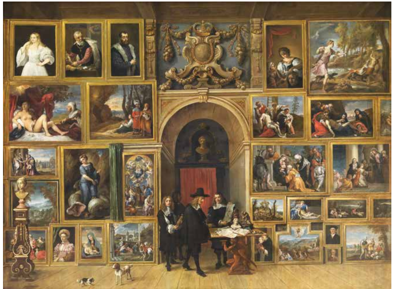
FIG 7 David Teniers II Archduke Leopold Wilhelm in His Gallery in Brussels, 1651. Oil on canvas, 96 × 129 cm. Royal Museums of Fine Arts of Belgium, Brussels, inv. 2569

The next step in the presentation and representation of the archducal gallery was the production of a volume of engravings: the famous Theatrum Pictorium ['Theatre of Painting'], which Teniers published in 1660, four years after Leopold Wilhelm's departure for Vienna. 34 The project was conceived in consultation with the archduke, who probably also financed it. 35 Reproduced within its pages were the famous Italian paintings which also appear so