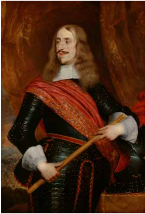
FIG 2 Pieter Thys Archduke Leopold Wilhelm, 1650–56. Oil on canvas, 127 × 86 cm. Kunsthistorisches Museum, Vienna, Gemäldegalerie, GG 370

Fuggers and later passed into Steininger's possession. They include two representations of women and an allegory of Mars Disarming Cupid and Venus (fig. 3).