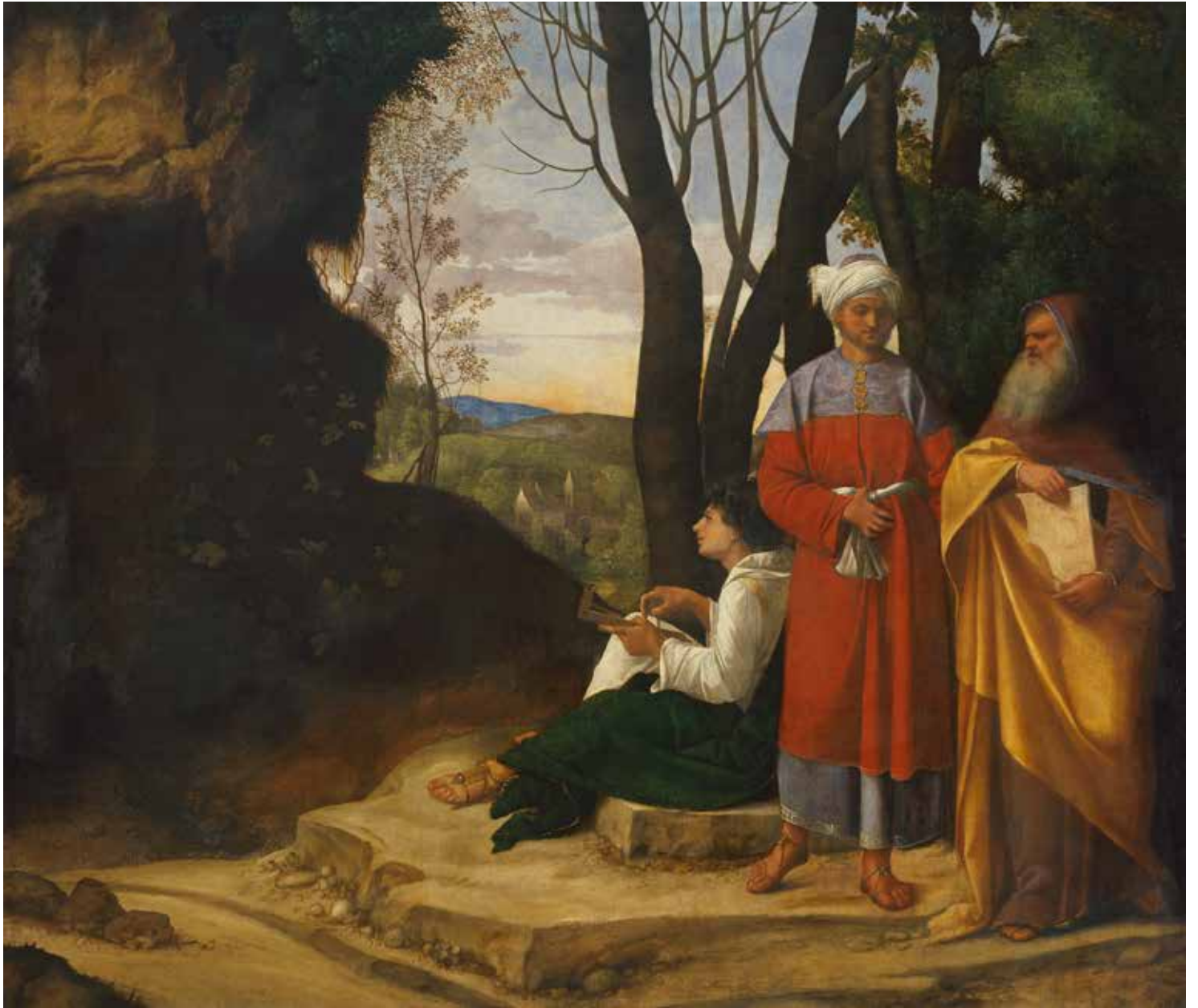
FIG 8 Giorgione The Three Philosophers , 1508–9. Oil on canvas, 125.5 × 146.2 × 3.5 cm. Kunsthistorisches Museum, Vienna, Gemäldegalerie, GG 111