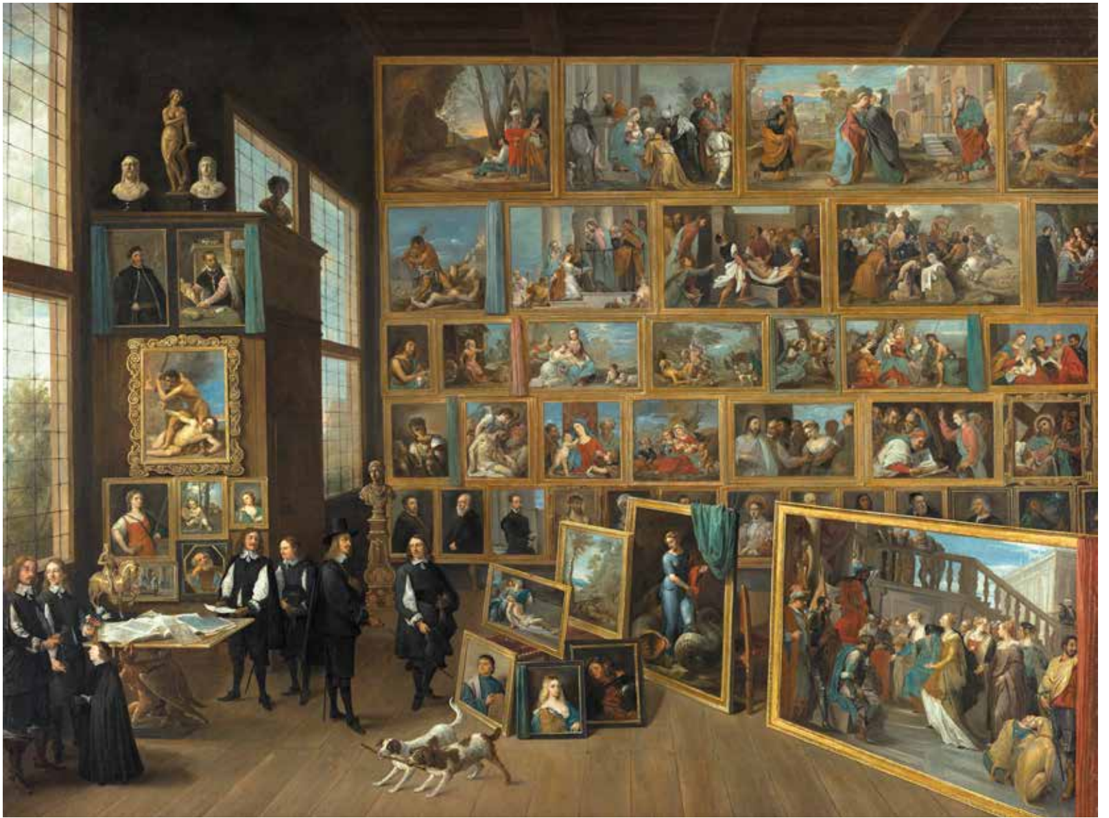
FIGS 4–6 David Teniers II Archduke Leopold Wilhelm in His Gallery in Brussels, c. 1650. Oil on canvas, 124 × 165 cm. Kunsthistorisches Museum, Vienna, Gemäldegalerie, GG 739. The details show the names of the artists on the paintings.