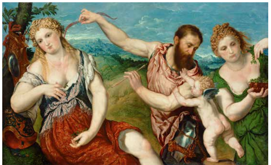
FIG 3 Paris Bordone Allegory: Mars Disarming Cupid and Venus , c. 1560. Oil on canvas, 110 × 176 cm. Kunsthistorisches Museum, Vienna, Gemäldegalerie, GG 69

Many of the paintings reproduced in the Brussels gallery picture (fig. 7) carry numbers on their frames, which match those in the inventory of Leopold Wilhelm's collection compiled in 1659 in Vienna. This inventory took up and continued the numbering employed in