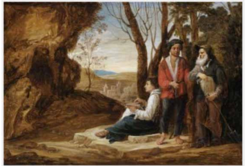
FIG 9 David Teniers II after Giorgione The Three Philosophers . Oil on canvas, 21.5 × 30.9 cm. National Gallery of Ireland, Dublin, NGI.390