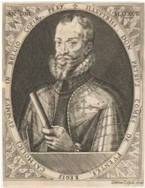
FIG 3 Dominic Custos Pedro Enríquez de Acevedo, Count of Fuentes, 1600–1604. Engraving, 160 × 125 mm. Rijksmuseum, Amsterdam, Rijksprentenkabinet, RP-P-OB-31.639