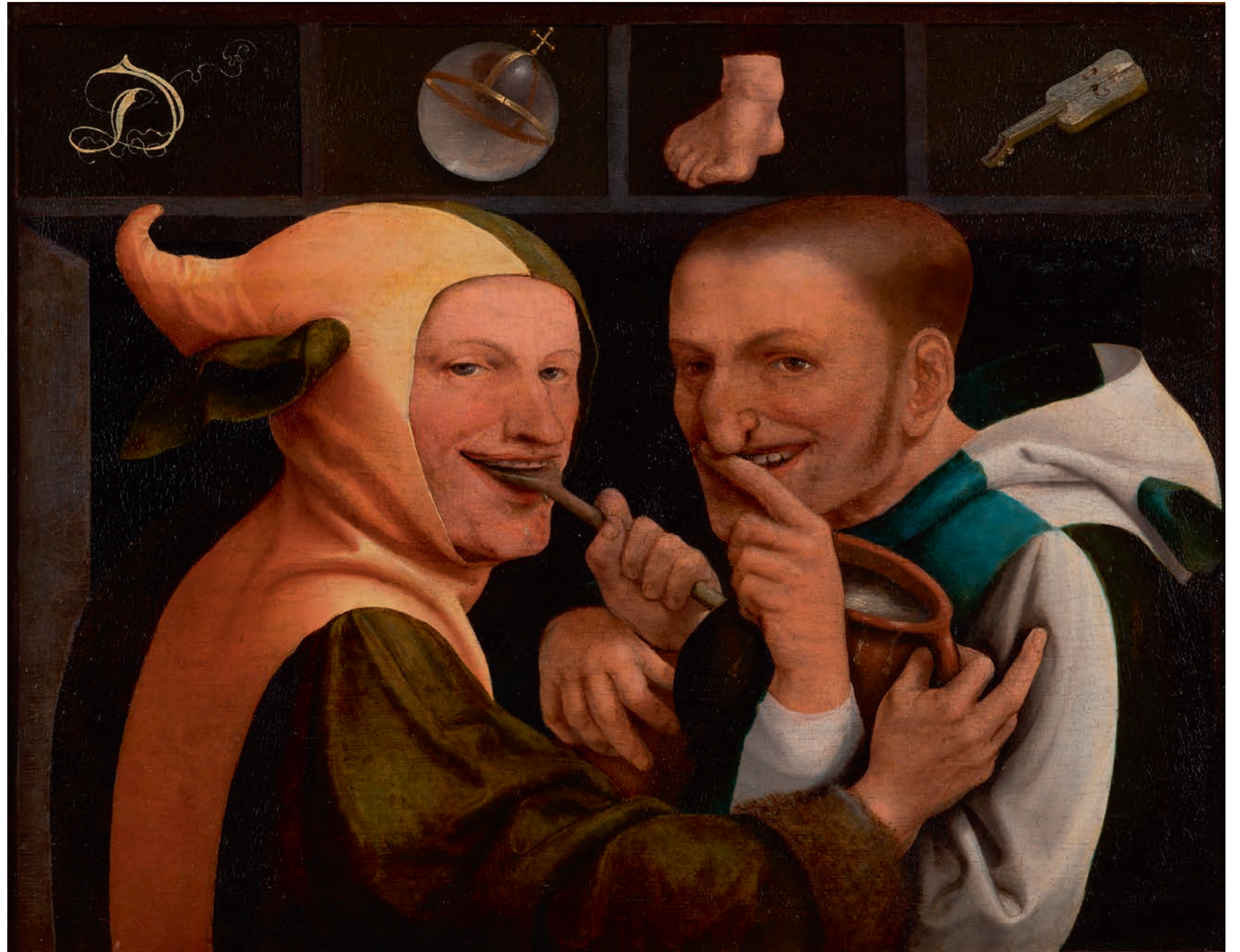
Circle of Jan Massijs Rebus: The World Feeds Many Fools , c.1530-40 Oil on panel, 37.5 × 48.2 cm ANTWERP, THE PHOEBUS FOUNDATION