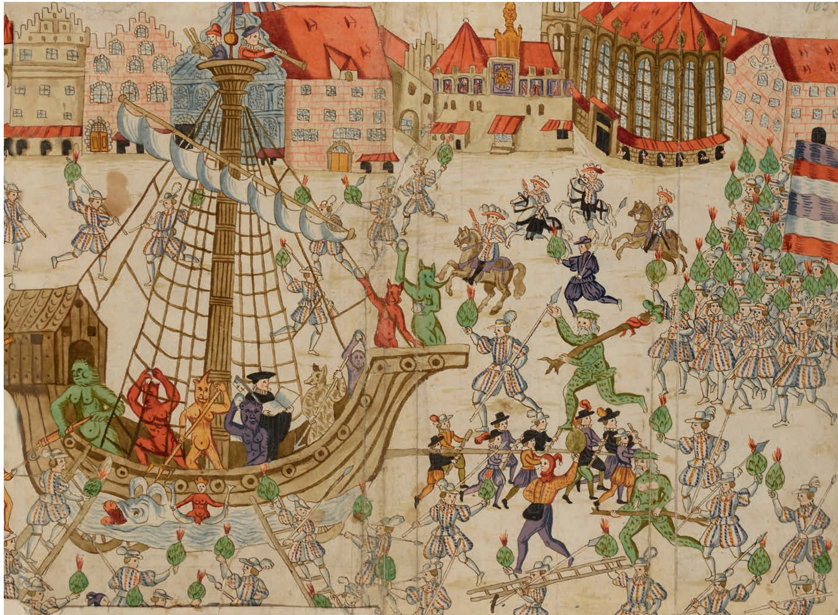
Unknown Artist Schembart Parade in Nuremberg, 1539 Watercolour on paper, c.320 × 410 mm NUREMBERG, GERMANISCHES NATIONALMUSEUM