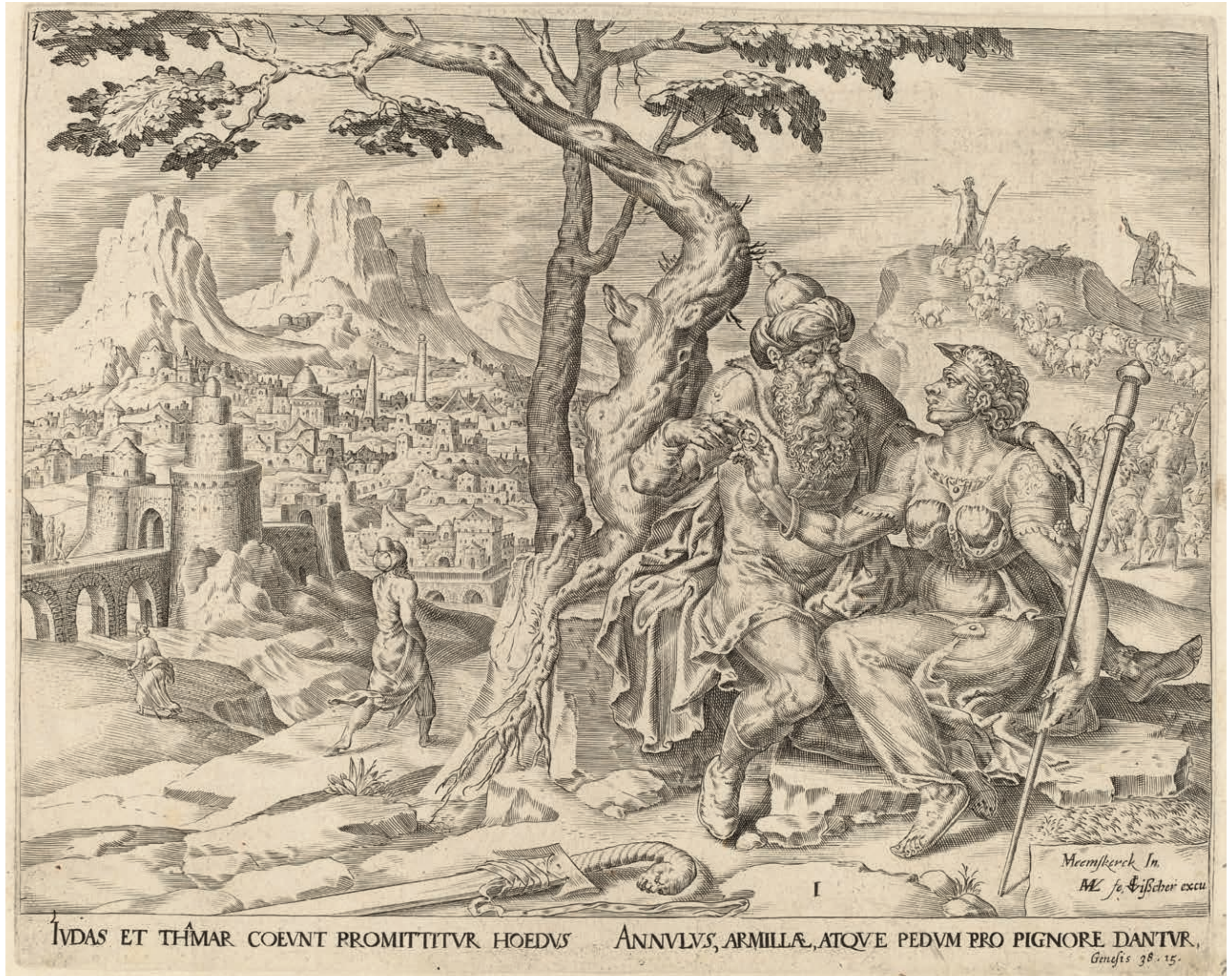
Harmen Jansz Muller after Maarten van Heemskerck Judah and Tamar, c.1566 Engraving, 247 × 355 mm WASHINGTON, NATIONAL GALLERY

JUDAS ET THĀMAR COEVNT PROMITTITVR HOEDVS ANNVLVS, ARMILLĀ, ATQVE PEDVM PRO PIGNORE DANTVR, Genesis 38. 15.