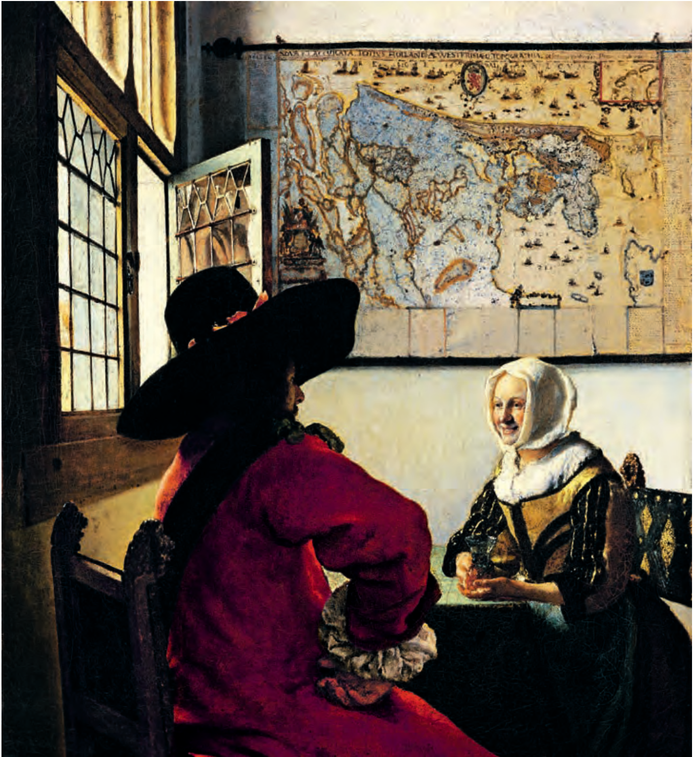
CAT. 7 Officer and Laughing Girl c. 1657–1658