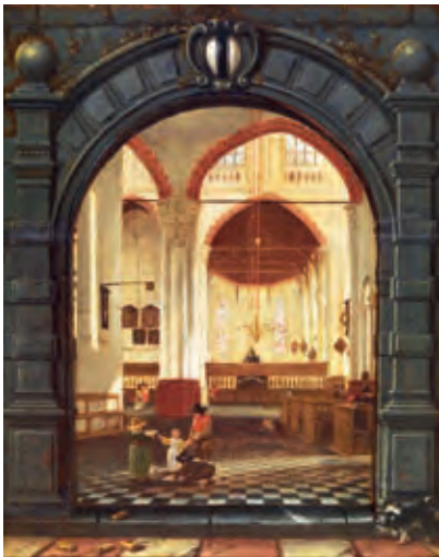
FIG. 3 Louys Aernoutsz Elsevier, Interior of the Oude Kerk in Delft , 1653. Oil on canvas on panel, architectural frame on panel, 54.5 × 44.5 cm (together). Lisbon, Museu Nacional de Arte Antiga, inv. no. 1721

This commentary on the painting's meaning relates to its subject, the girl at the open window reading a letter – given this context, presumably a love letter – with an air of intense concentration. Once again, Vermeer closes off the space at the front with an oriental carpet, which is lying on a table. To the left the carpet rises in large folds on which a Chinese bowl filled with fruit is lying tilted to the right. Vermeer enhances the effect of the back wall, which with its Cupid picture is parallel to the picture plane, with a window wall at right angles to it. Henceforward, this motif of a room corner was one that Vermeer would adopt repeatedly. A red curtain