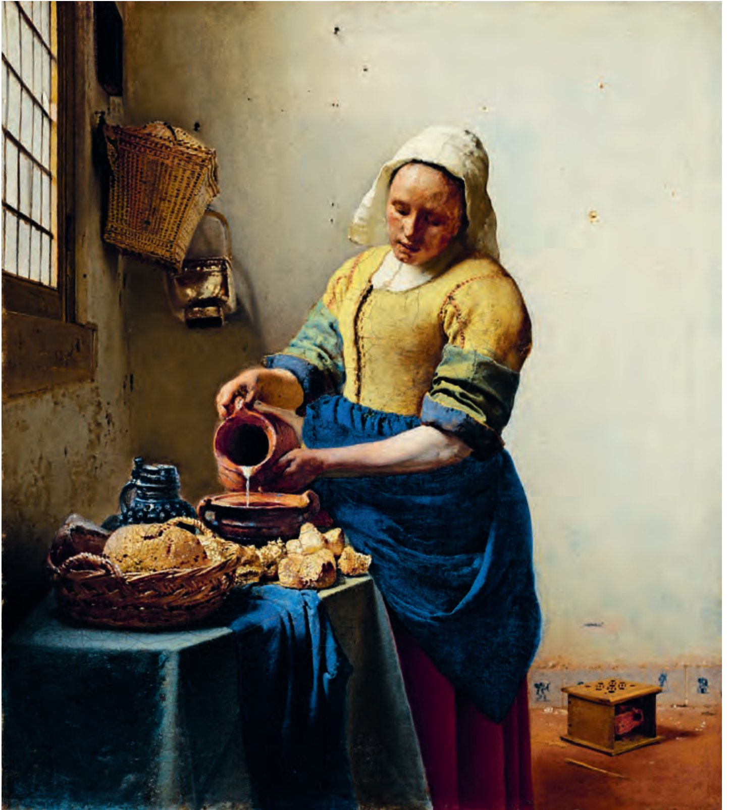
CAT. 8 The Milkmaid c. 1658–1659