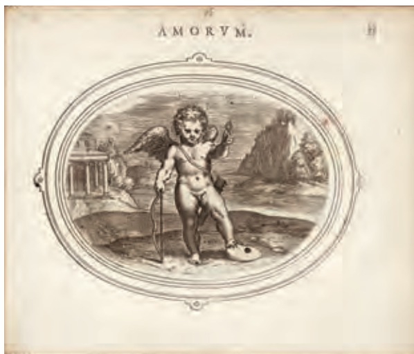
FIG. 2 Cornelis Boel, 'Inconscussa fide' (Sincere), emblem from Otto van Veen, Amorum emblemata , Antwerp, 1608, p. 55. Engraving, 151 × 202 mm Amsterdam, Allard Pierson, University of Amsterdam, OK 63-5938

In the painting on the left in the background, which is only partly visible, all that can be seen is the leg of a child and in front of it an upright mask; lying flat on the ground is a second mask, which has been transformed (in a restoration?) into a pile of debris. 7 Because the picture is only shown in part, the masks are the sole elements that can be regarded as pictorial motifs significant for the depiction as a whole. Traditionally regarded as signs of deception and falsehood, they complement what is and what has been going on in the foreground. But it is left up to the viewer to establish some