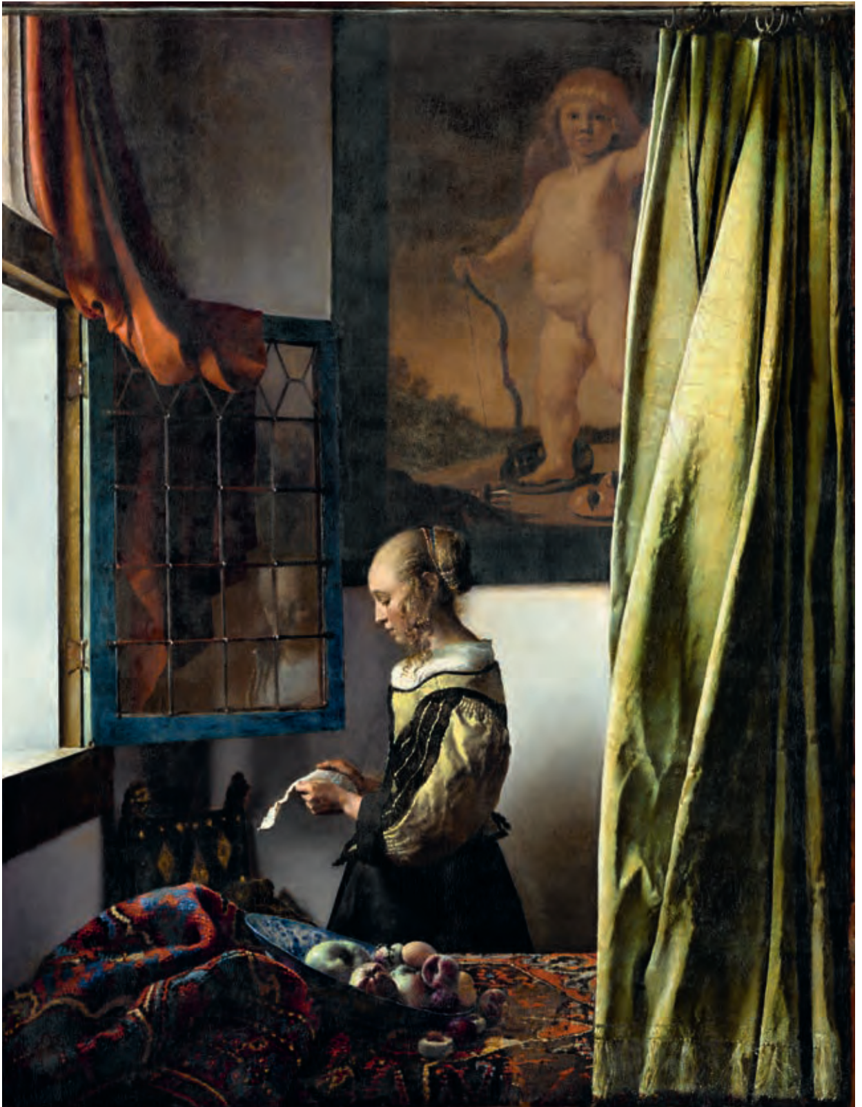
CAT. 6 Girl Reading a Letter at an Open Window c. 1657–1658