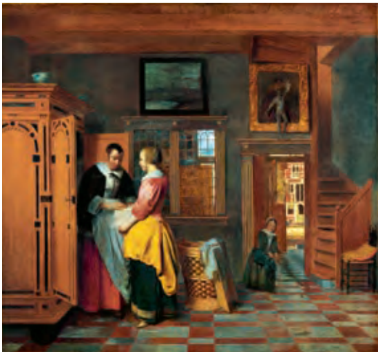
FIG. 13 Pieter de Hooch, Interior with Women beside a Linen Cupboard , 1663 Oil on canvas, 70 × 75.5 cm. Amsterdam, Rijksmuseum, inv. no. SK-C-1191; on loan from the City of Amsterdam

Immediately adjoining the great hall was a small room whose location was described by the notary's clerk as the 'small room next to the aforementioned great hall'. This also contained a fireplace adorned with a green mantelpiece coverlet. The furnishings of the room were modest. There were only two paintings and a worn mirror on the wall. This intermediate space has indeed been characterized in the art history literature primarily as a storage place for old things. 146 And in fact the 'rack', the 'green-painted wooden coffer with iron fittings' and the 'large, tall, tin container' must have