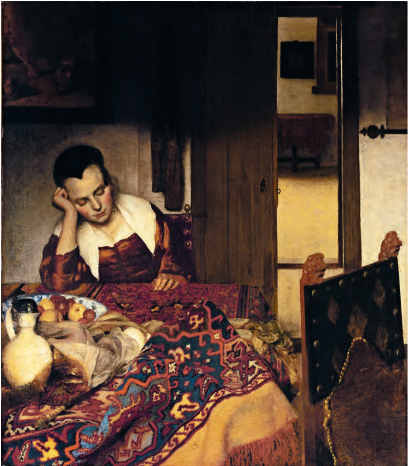
CAT. 5 A Maid Asleep c. 1656–1657