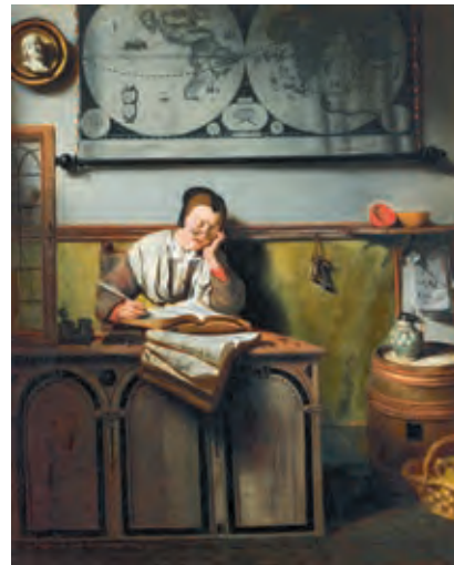
FIG. 1 Nicolaes Maes, The Account Keeper , 1656 Oil on canvas, 66 × 53.7 cm Saint Louis, Saint Louis Art Museum, inv. no. 72.1950

On the table, the carpet is rucked forward in the middle, with the area to its left occupied by a compact still life – porcelain bowls with fruit partially covered by cloths, a silver spoon, at the front a knife with an ornamented handle, a roemer glass that has been knocked over, and a white lidded jug. Clearly, a second person was sitting here, who has hastily left the table. In front of the slumbering maid is a Venetian glass, still half-filled, giving a clue as to her physical state – and even auction records of 1696 refer to her as ‘een dronke slapende Meyd’ (a drunk maid asleep). 5 All this confirms the impression that we are being allowed to observe a very intimate situation, being made as it were witnesses of a