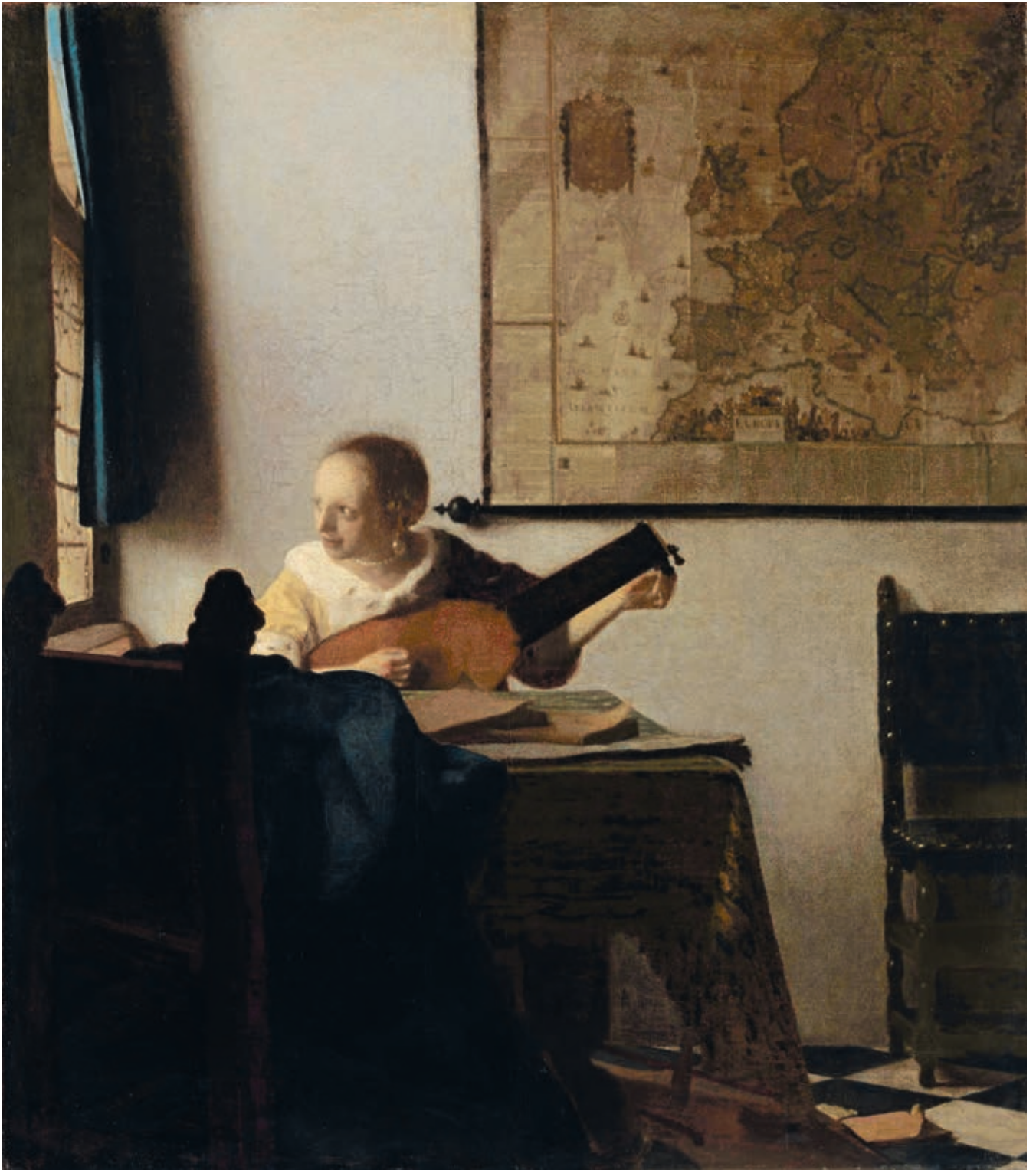
CAT. 18 Young Woman with a Lute c. 1662–1664