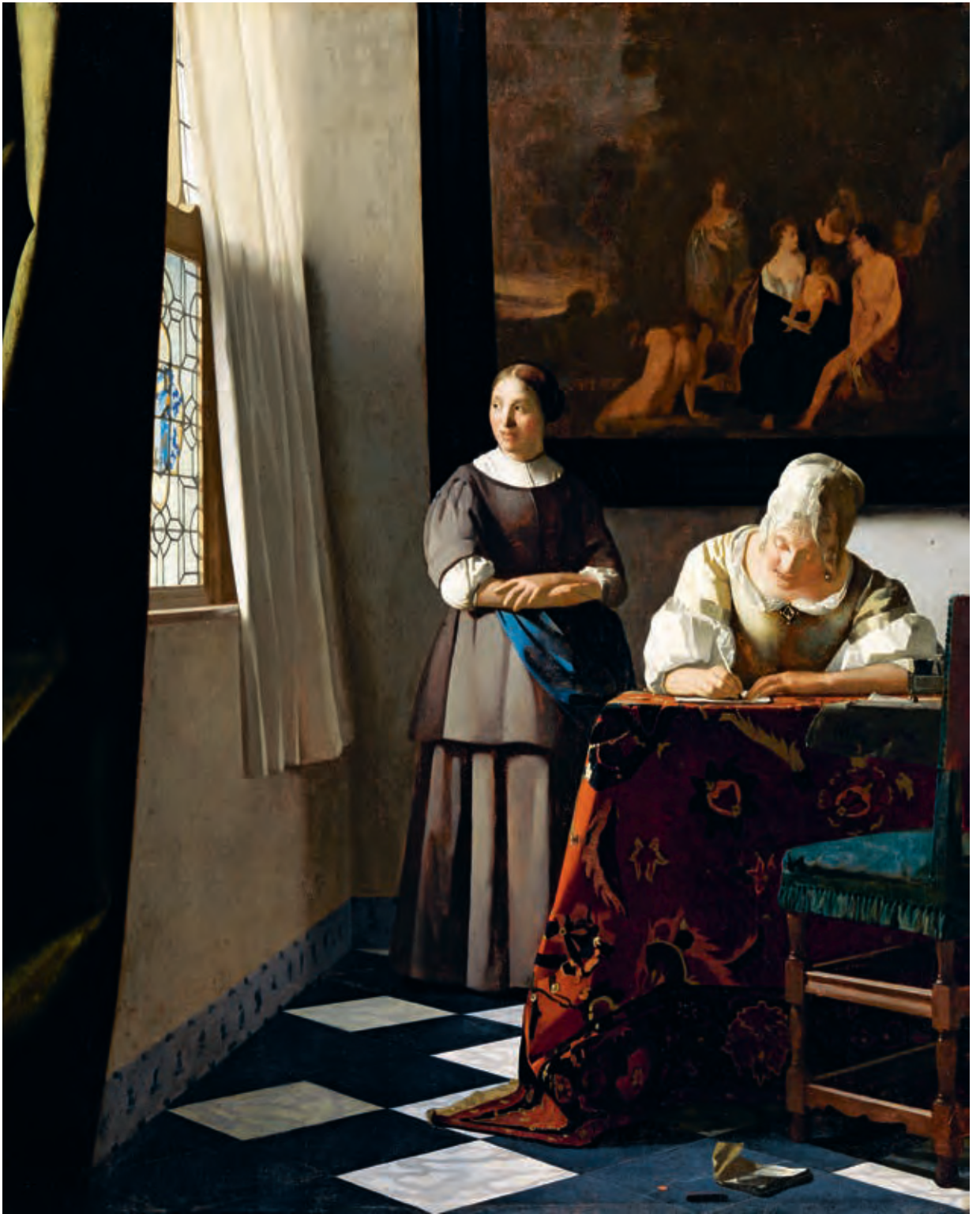
CAT. 35 Woman Writing a Letter, with her Maid c. 1670–1672